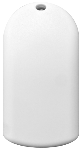
Front of Case Mockup