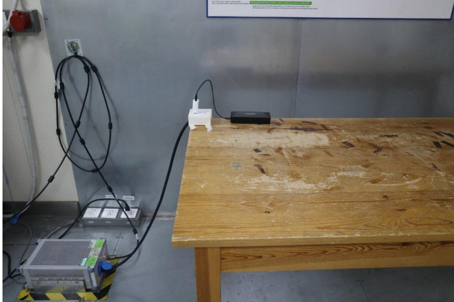
DXX radiation L