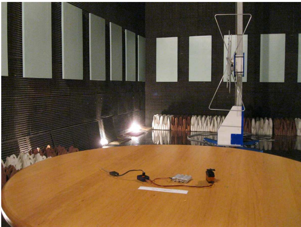
Figure 2.6.2 - Radiated Emission Test (Frequency Range 30 MHz – 1000 MHz)