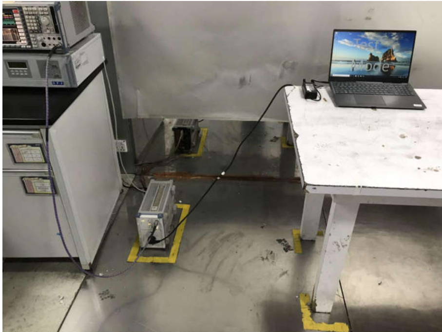
Conducted Emissions Test Setup-1