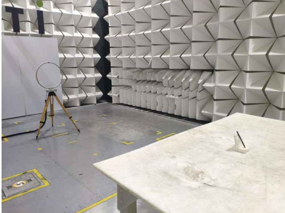
Radiated spurious emission Test Setup-1(Below 30MHz)