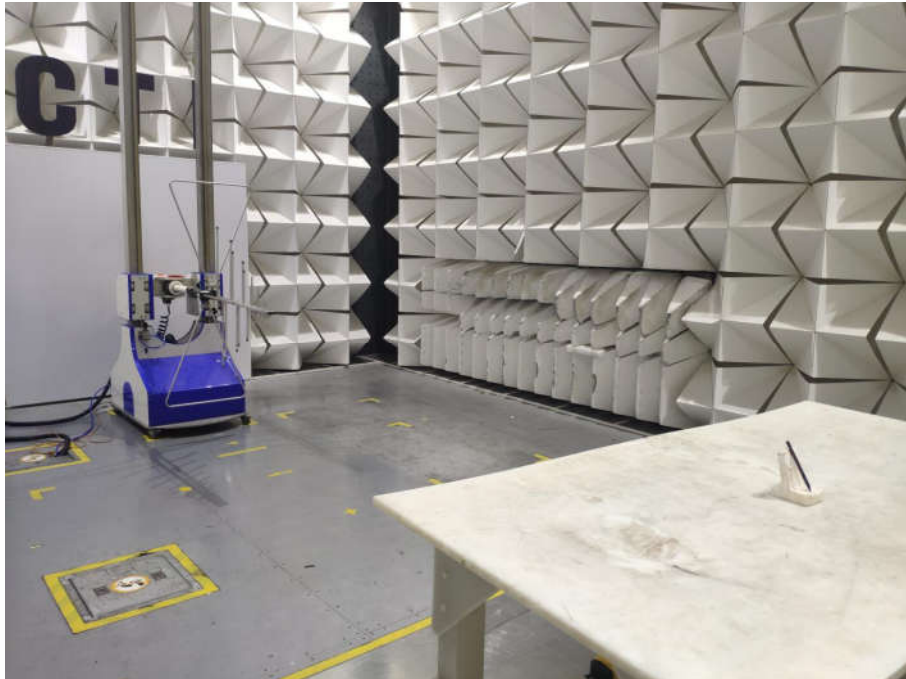
Radiated spurious emission Test Setup-2(Below 1GHz)