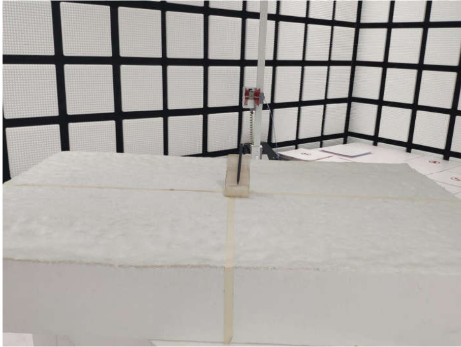
Radiated spurious emission Test Setup-3(Above 1GHz)