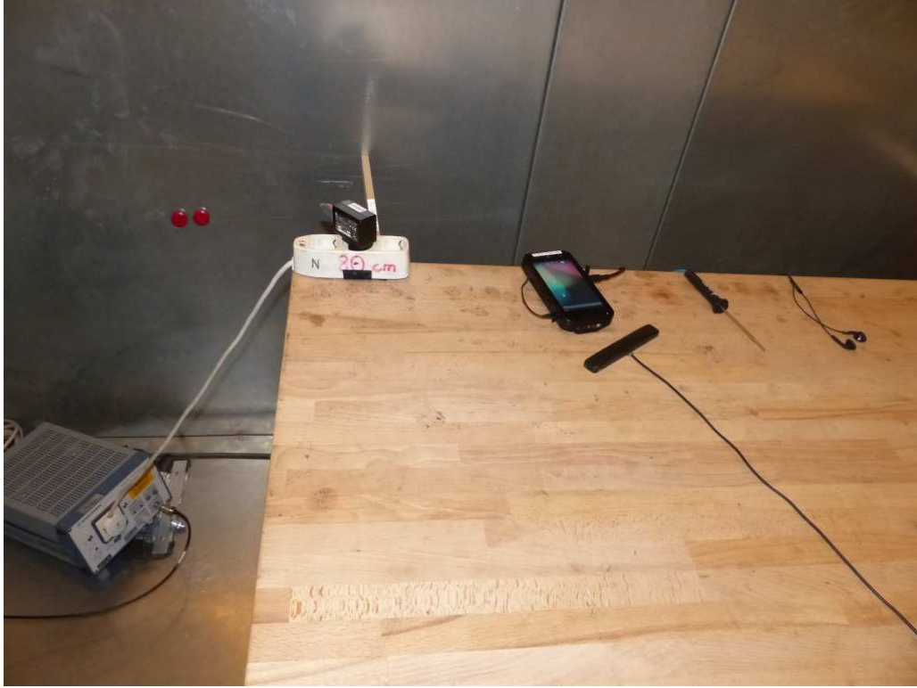
Photo 1: Test setup for conducted measurements (AC Port (power line), EUT Connected to the charger, intentional / unintentional radiator §15)