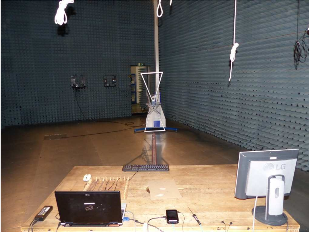
Photo 4: Test setup for radiated measurements (computer peripheral setup, EUT supplied by battery, unintentional radiator §15)