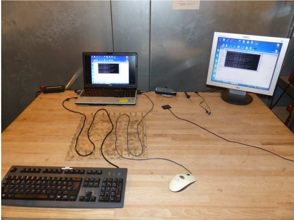
Photo 2: Test setup for conducted measurements (computer peripheral setup, EUT connected to the Laptop, unintentional radiator §15)