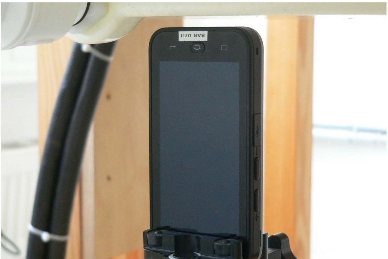
Fig. 21: Bottom side towards the phantom, 5mm distance.