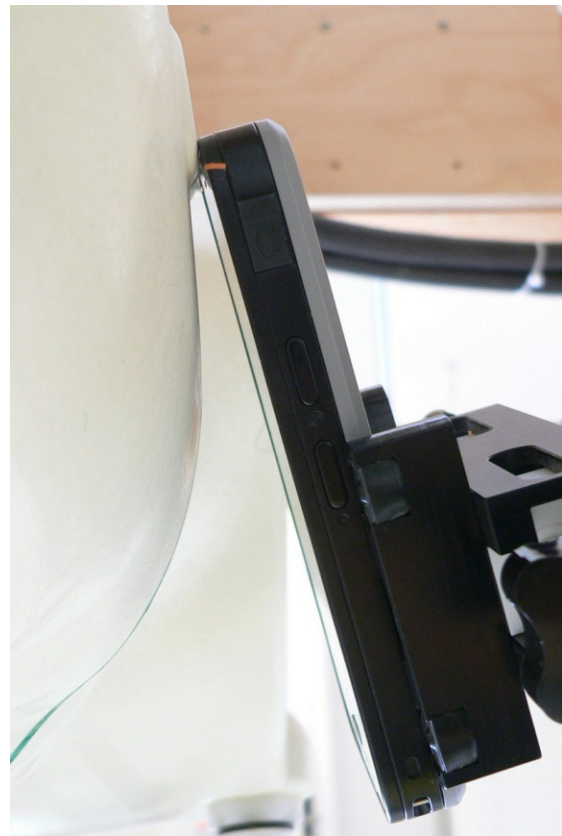
Fig. 26: Left Tilted towards the phantom.