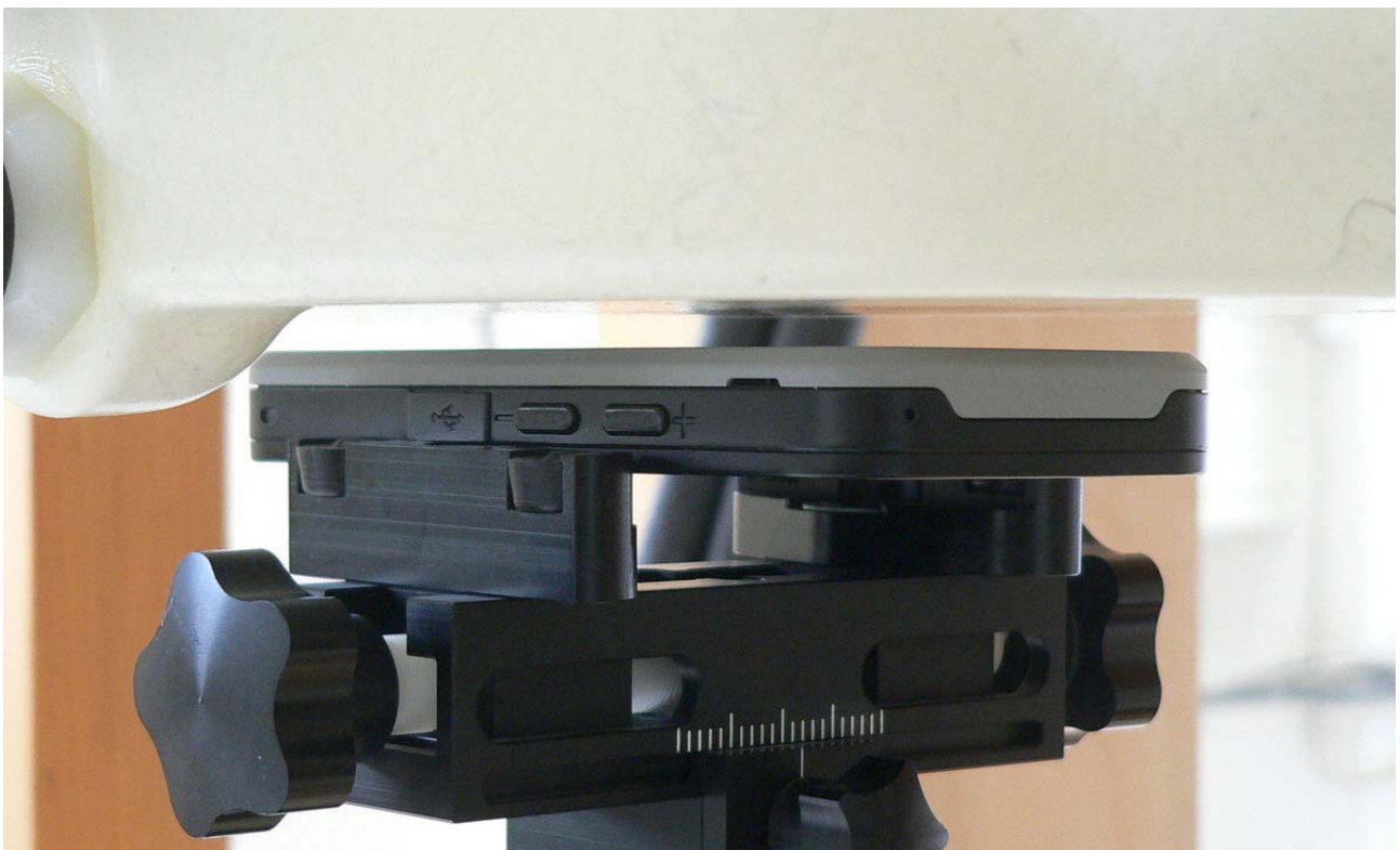
Fig. 19: Back side towards the phantom, 5mm distance.