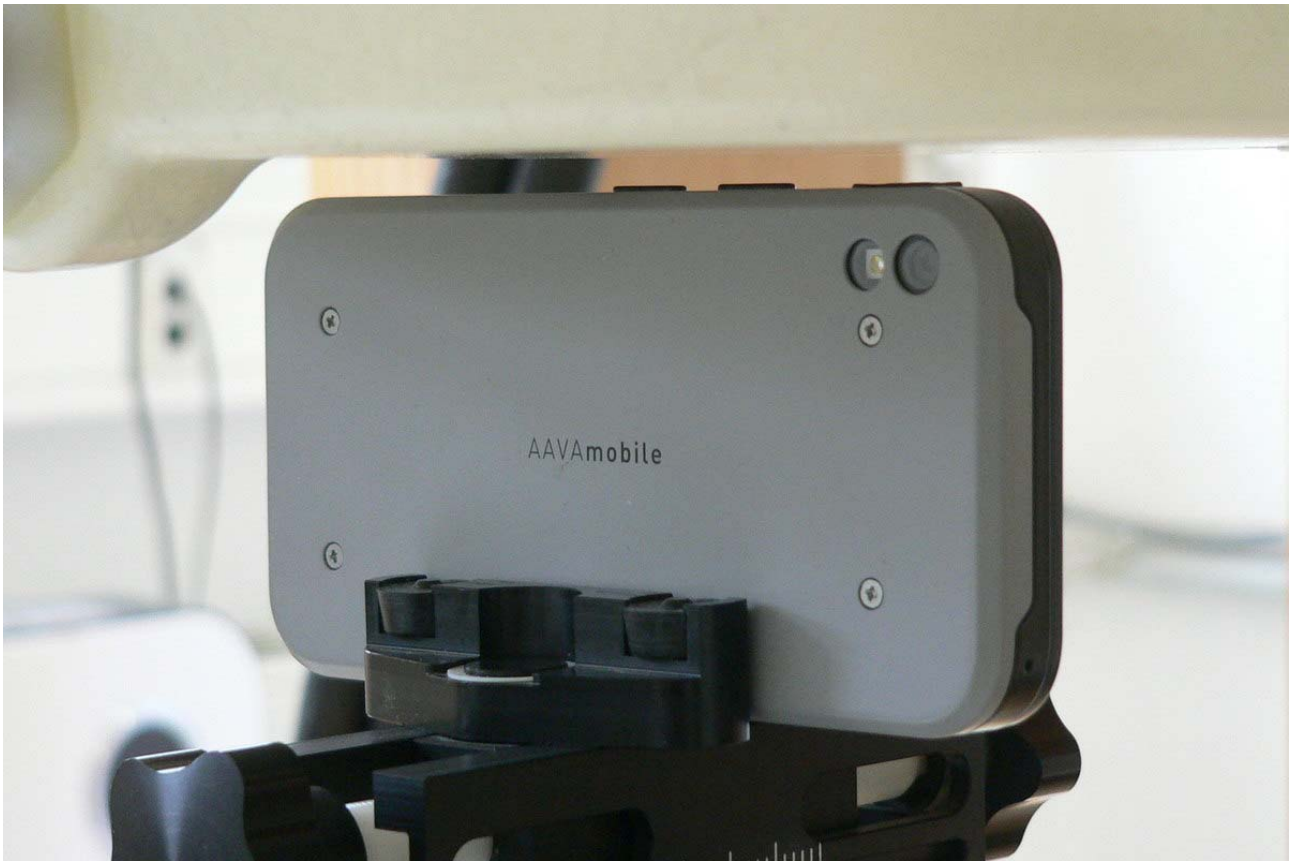
Fig. 20: Right side towards the phantom, 5mm distance.