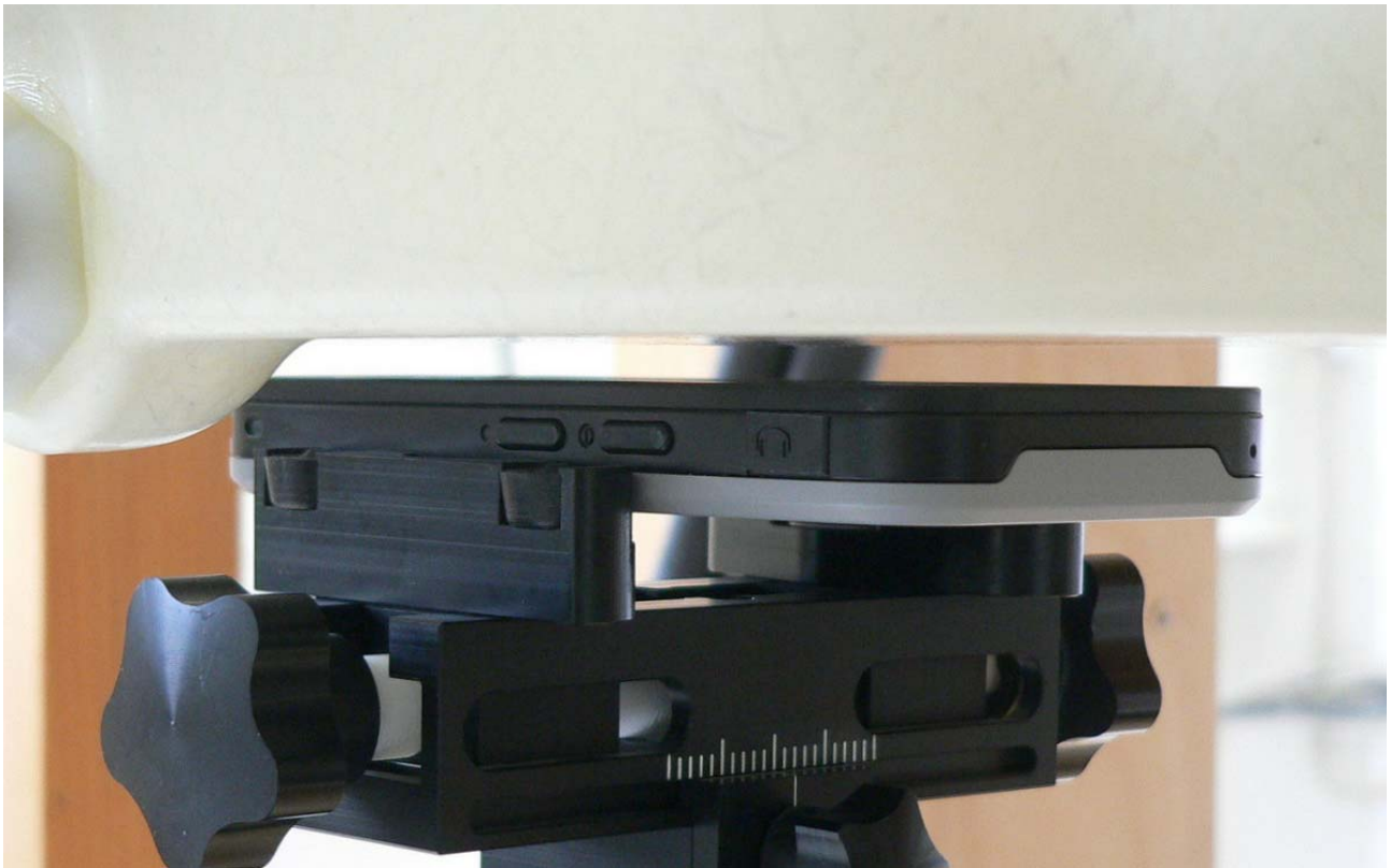
Fig. 18: Front side towards the phantom, 5mm distance.

Fig. 18 – 22 show the test positions for the SAR measurements.