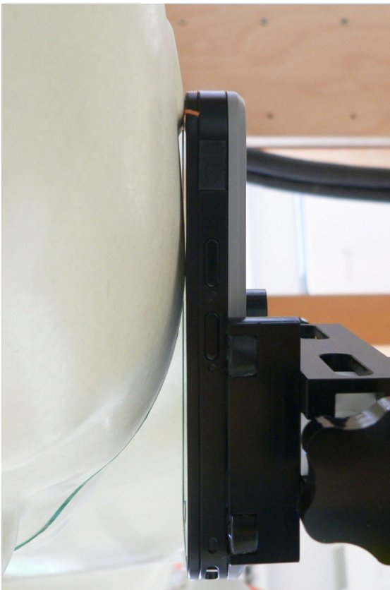
Fig. 25: Left Cheek of phantom.