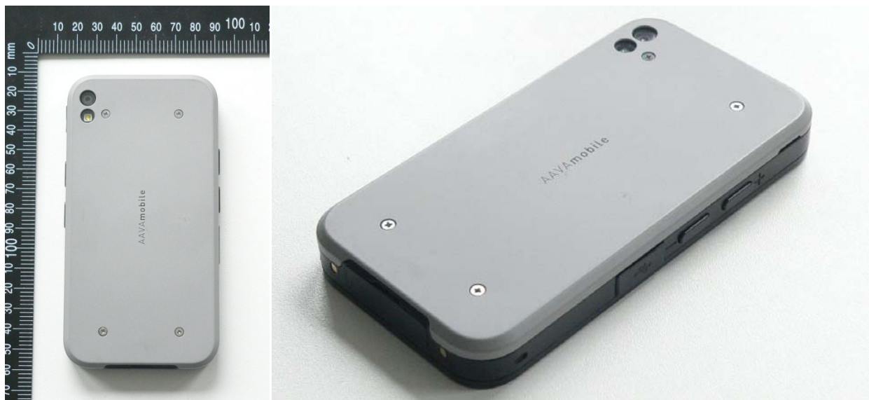
Fig. 16: Back view of the INARI5-WLAN-1.