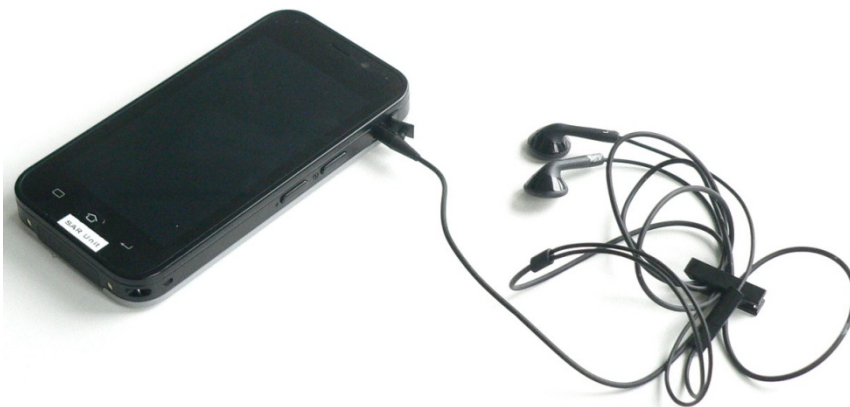
Fig. 17: Side view of the INARI5-WLAN-1 with attached headset.