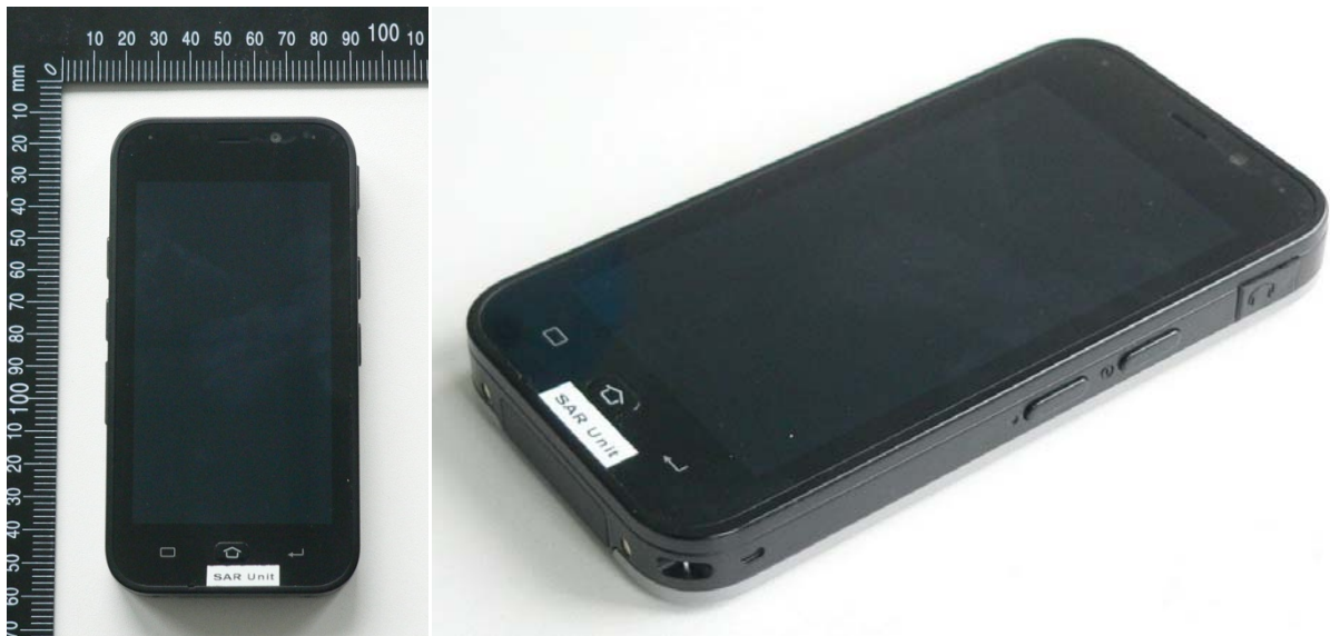
Fig. 15: Front view of the INARI5-WLAN-1 .