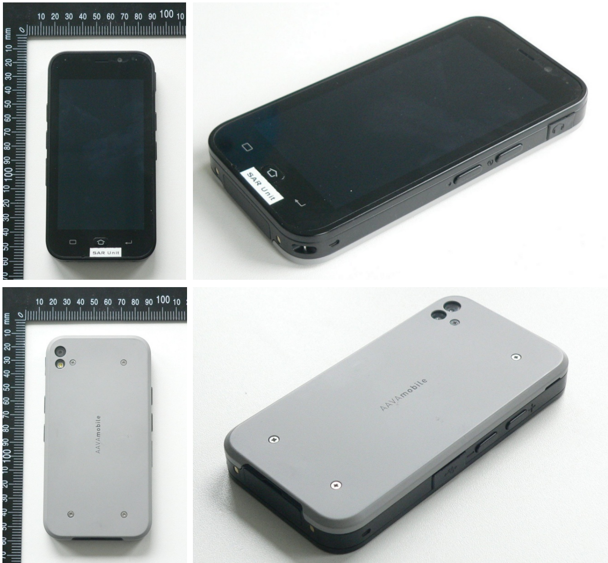
Fig. 1: Pictures of the device under test.