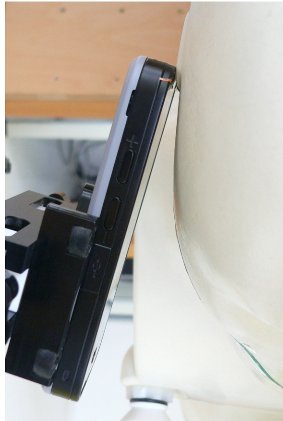
Fig. 24: Right Tilted towards the phantom.