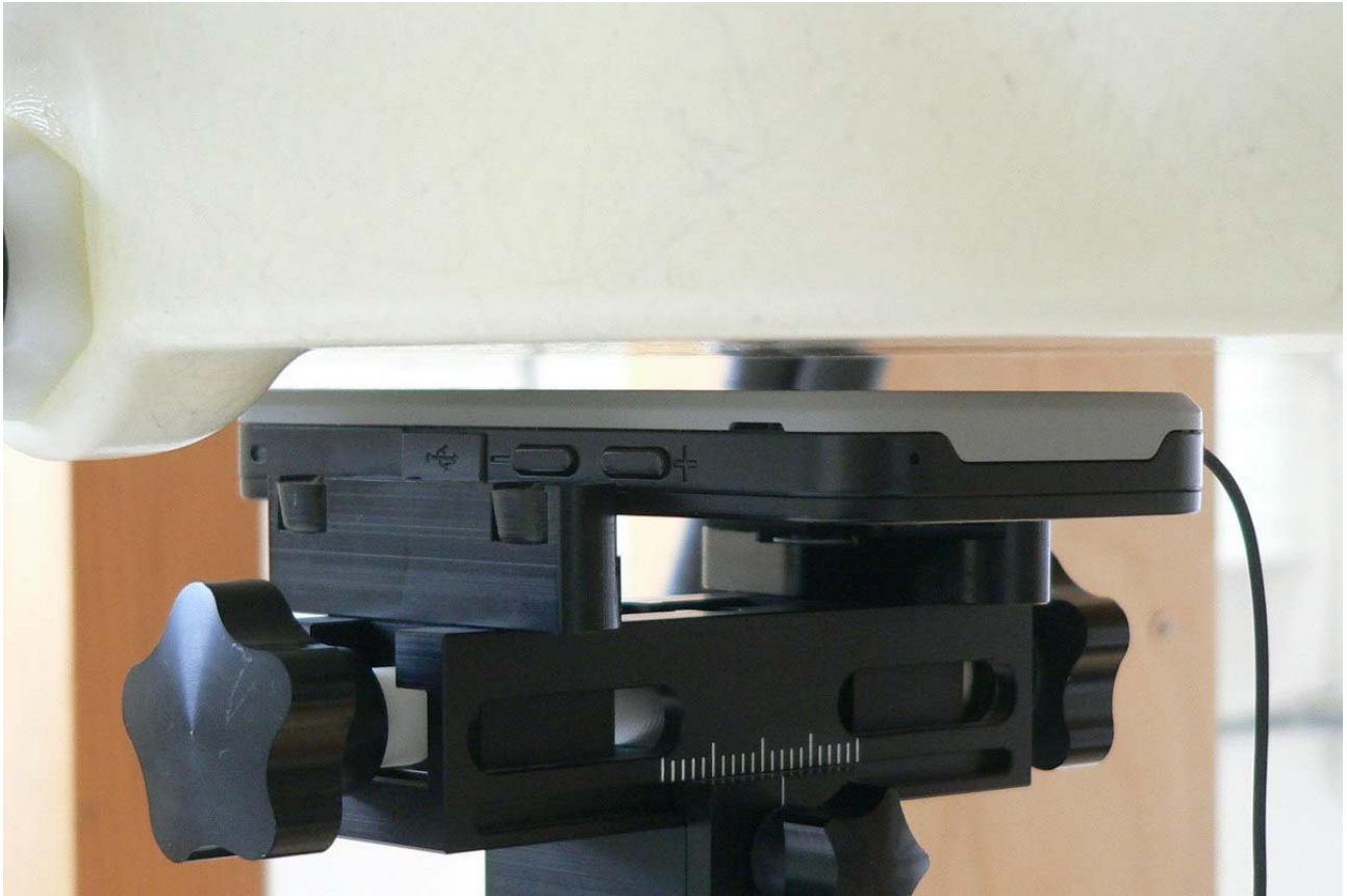
Fig. 22: Back side towards the phantom, 5mm distance, headset attached.