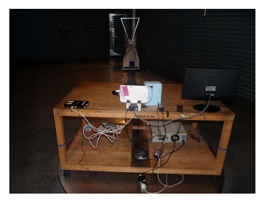
Photo 4: Test setup for radiated measurements (computer peripheral setup, EUT supplied by battery, unintentional radiator §15)