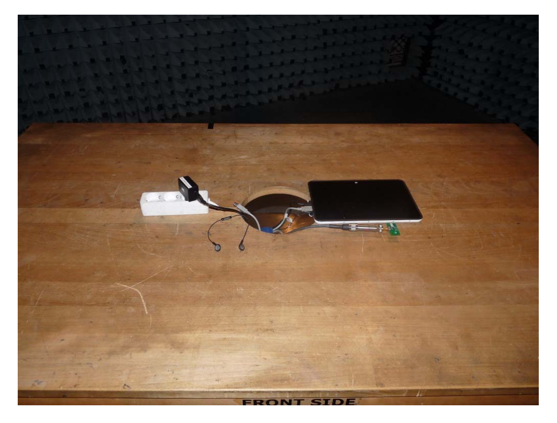
Photo 3: Test setup for radiated measurements (AC Port (power line), EUT supplied by battery, unintentional radiator §15)