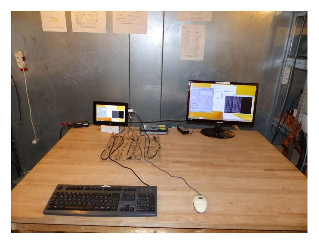
Photo 2: Test setup for conducted measurements (computer peripheral setup, EUT supplied by battery, unintentional radiator §15)