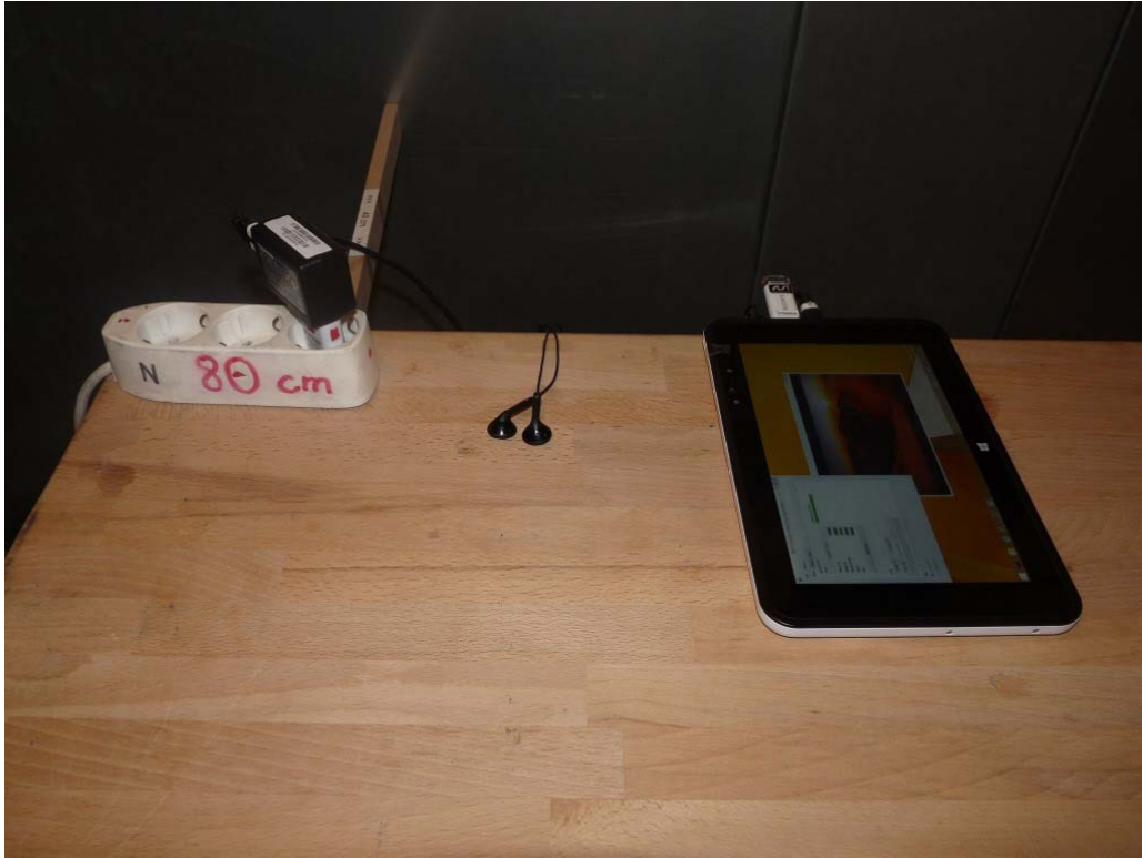
Photo 5: Test setup for conducted measurements (AC Port (power line), EUT supplied by AC/DC adapter, intentional / unintentional radiator §15)