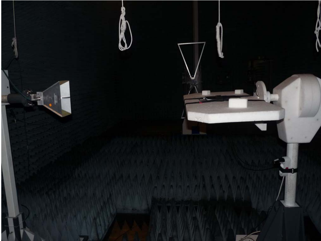
Photo 3: Test setup for radiated measurements (Enclosure, fully-anechoic chamber, 1-18 GHz intentional radiator §15 / 30 MHz – 10/20 GHz §22/24/27)