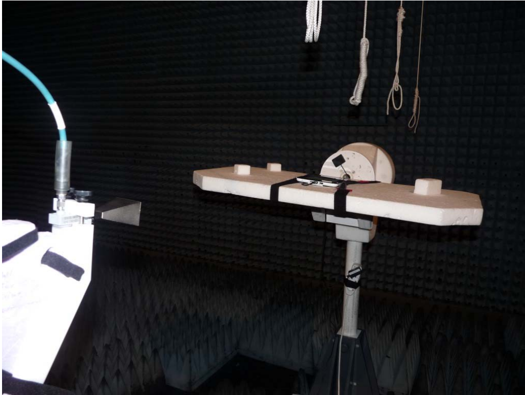
Photo 4: Test setup for radiated measurements (Enclosure, fully-anechoic chamber, 18-25 GHz, intentional radiator § 15)