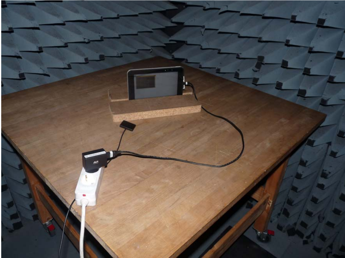
Photo 1: Test setup for radiated measurements (Enclosure, below 30 MHz, intentional radiator $15)