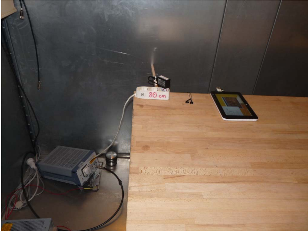
Photo 1: Test setup for conducted measurements (AC Port (power line), EUT supplied by AC/DC adapter, intentional / unintentional radiator §15)