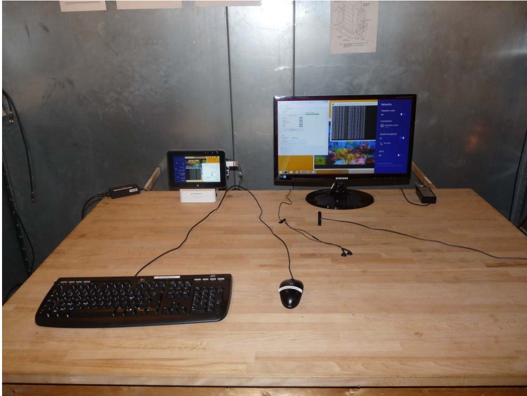
Photo 2: Test setup for conducted measurements (computer peripheral setup, unintentional radiator §15)