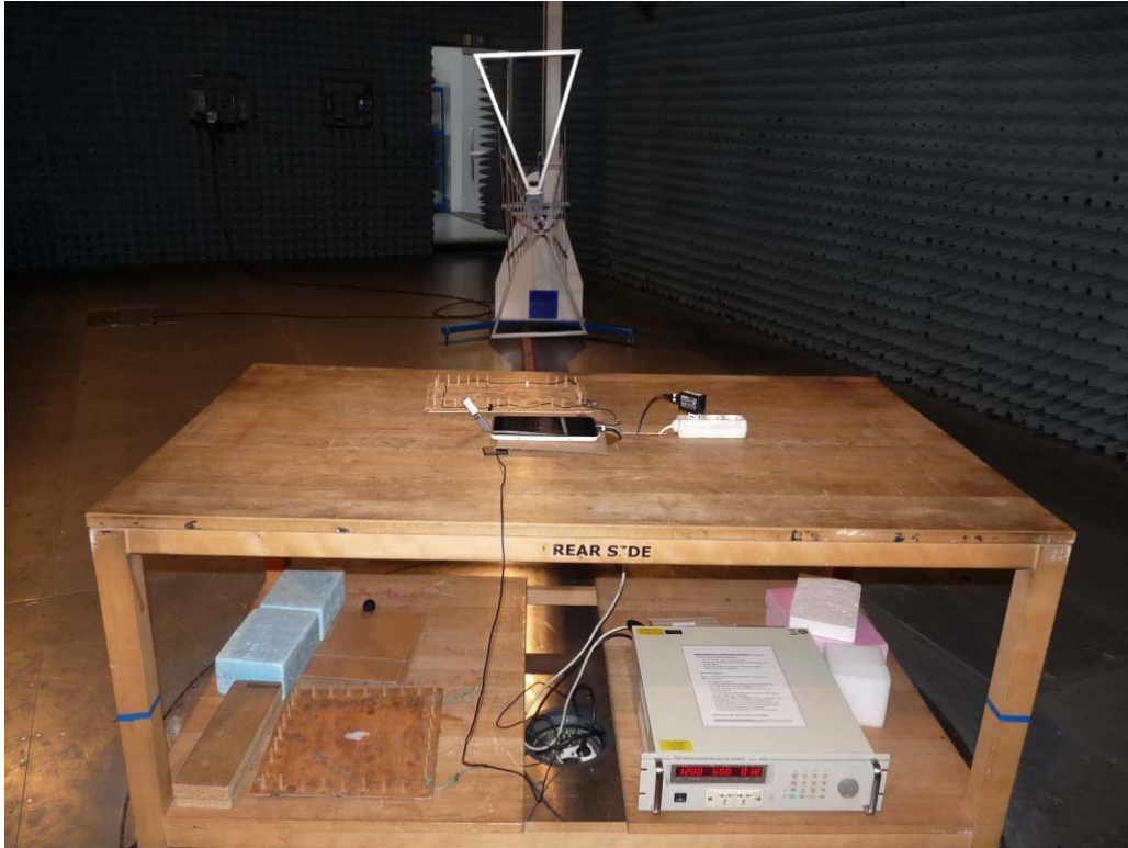
Photo 3: Test setup for radiated measurements (AC Port (power line), EUT supplied by AC/DC adapter, unintentional radiator §15)