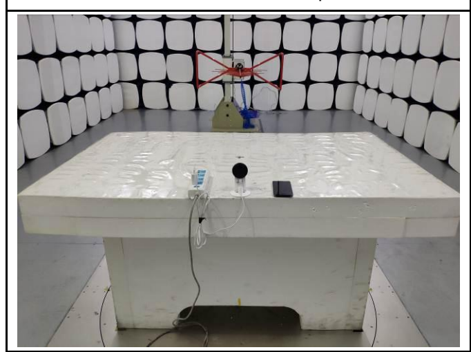
Radiated Spurious Emissions Test Setup Below 1GHz