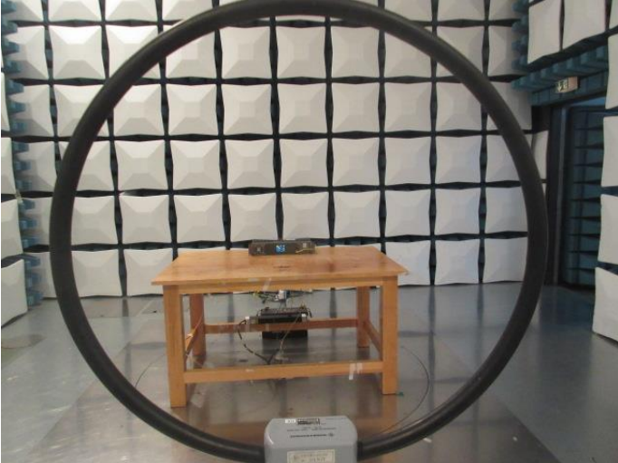
Transmitter Radiated Spurious Emission: