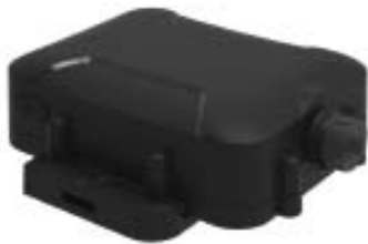
* MG5 with the bracket