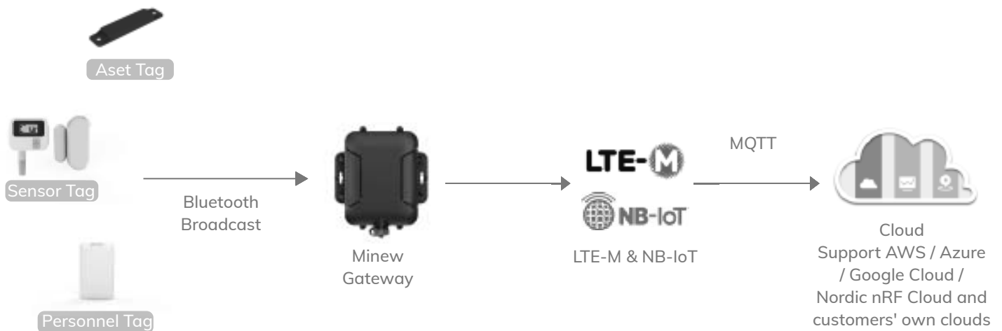
The working principle of MG5 gateway