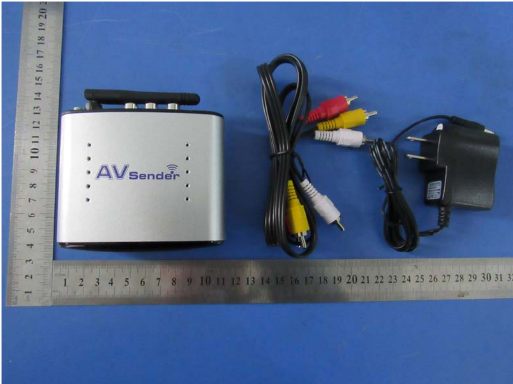
All Packages Front View