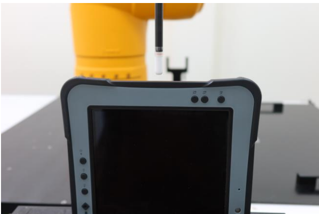
Edge4 at 2 mm