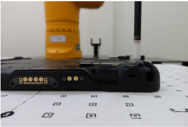
Bottom Face at 2 mm