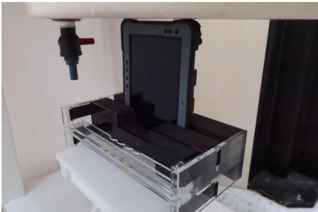
Edge4 at 0 mm