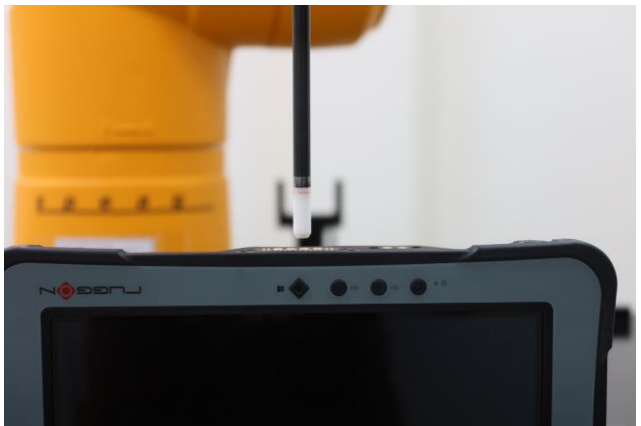
Edge3 at 2 mm