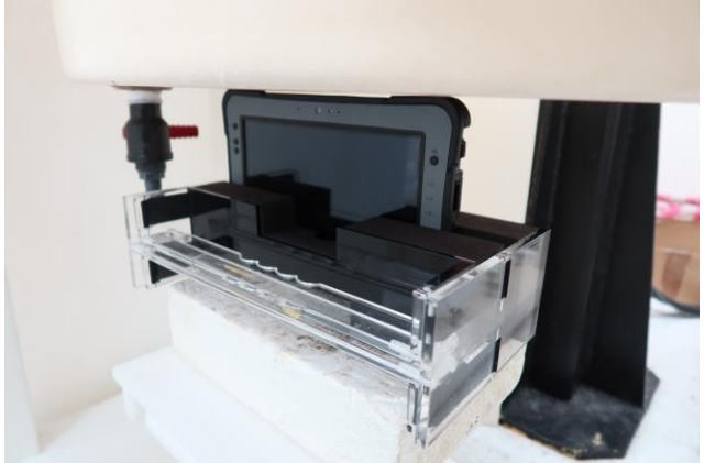
Edge1 at 0 mm