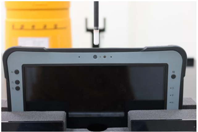
Edge1 at 2 mm