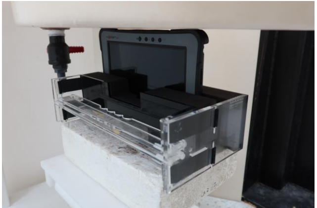
Edge3 at 0 mm