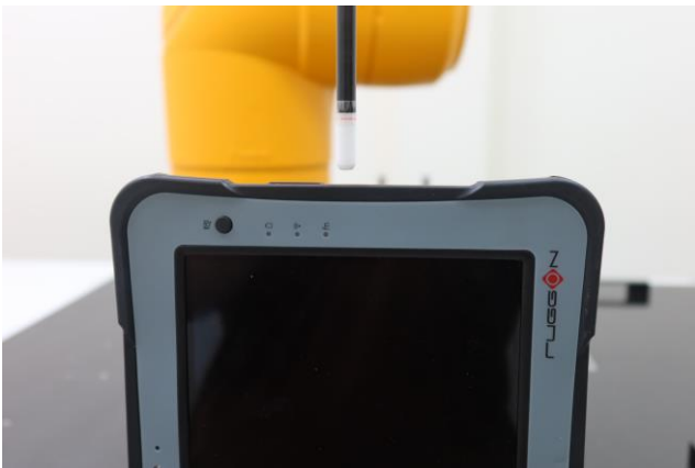
Edge2 at 2 mm