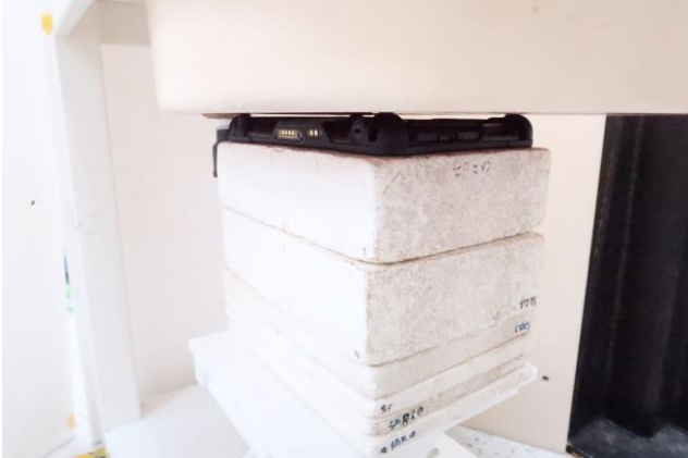
Bottom Face at 0 mm