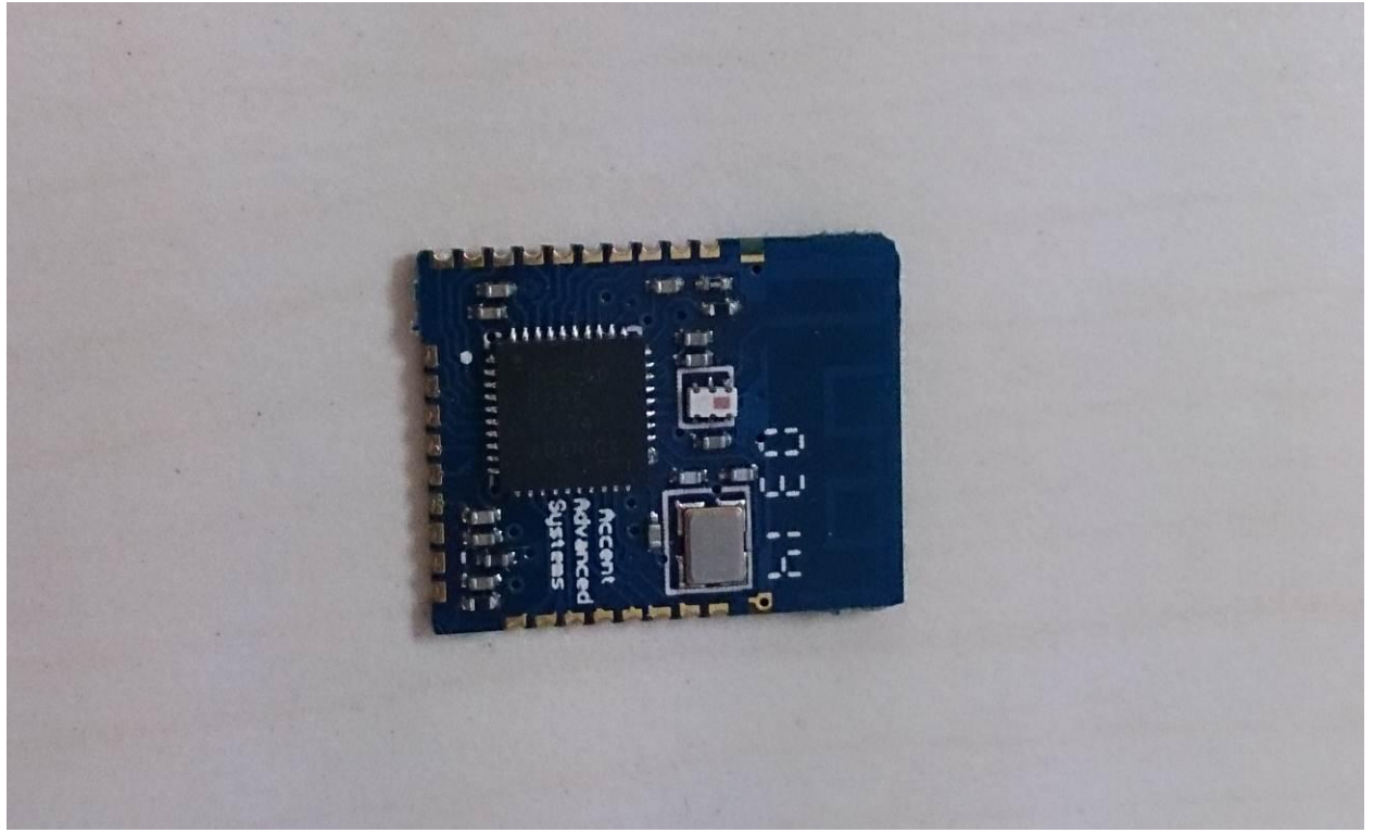
Fig. 1: External view

Type Designation: USMART10 Report Number: 17042940 001