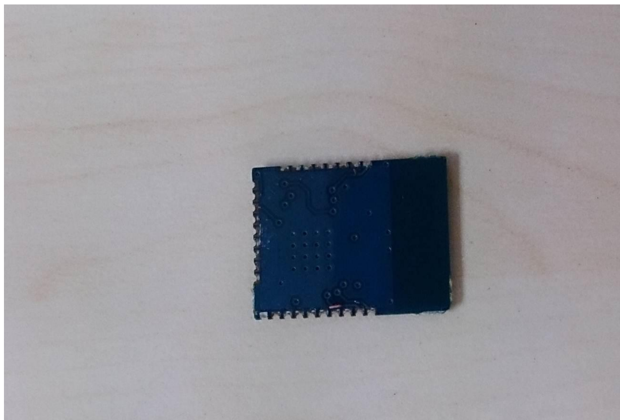
Fig. 4: Internal view