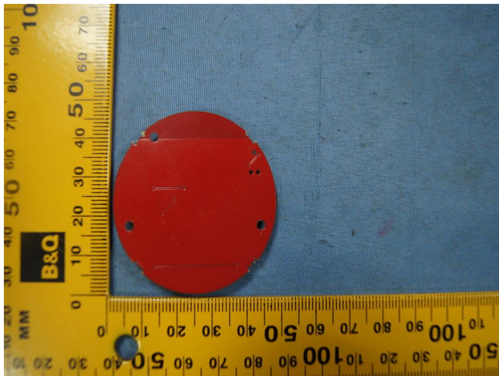
Fig. 2: Internal view