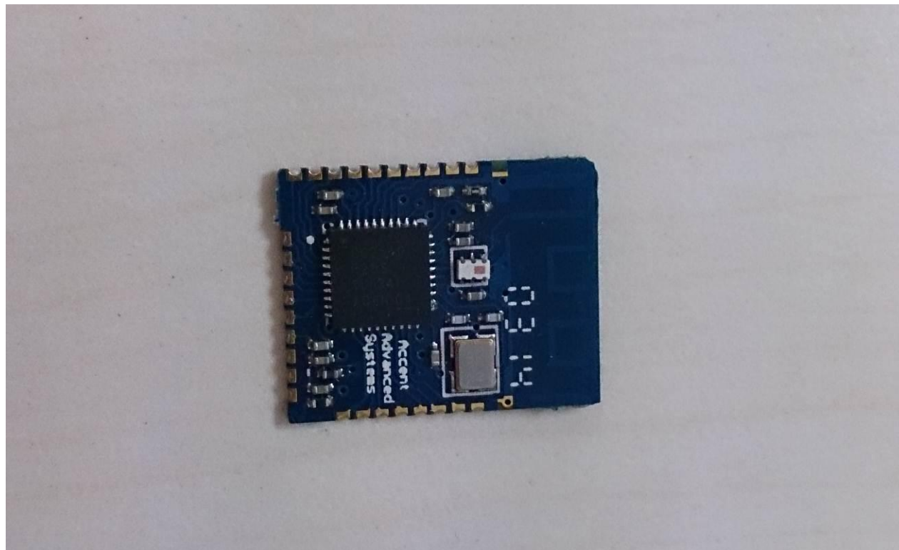
Fig. 3: Internal view

Type Designation: IBK10 Report Number: 17042940 002