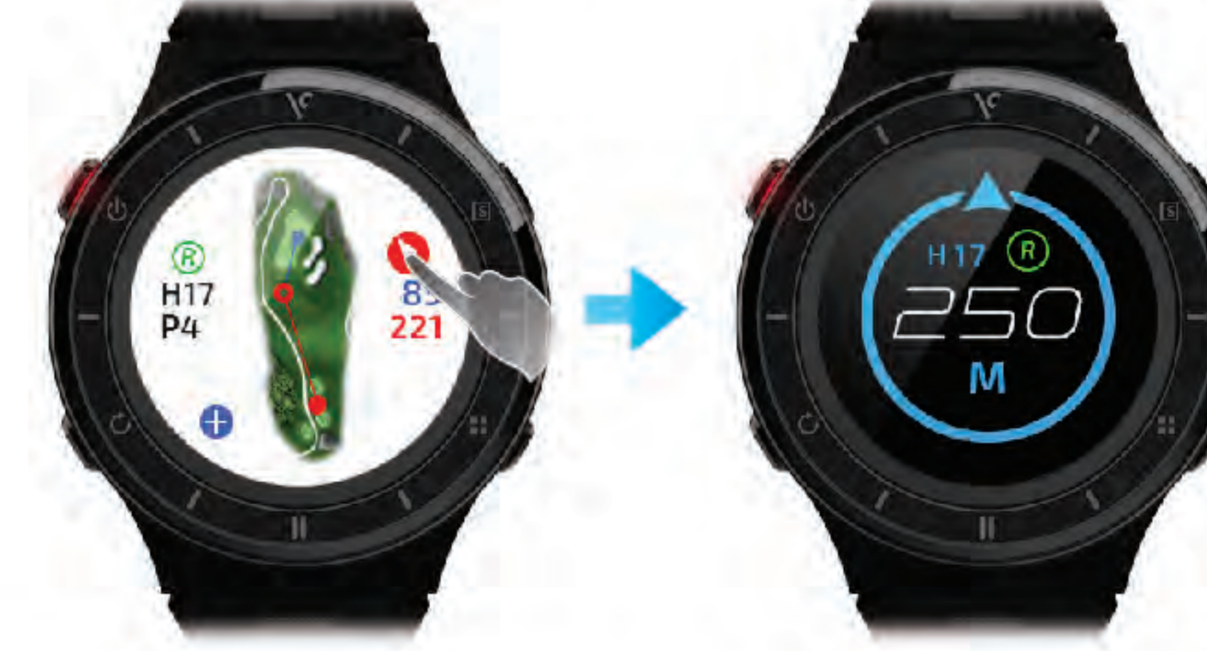
Tapping Pin Pointing Icon