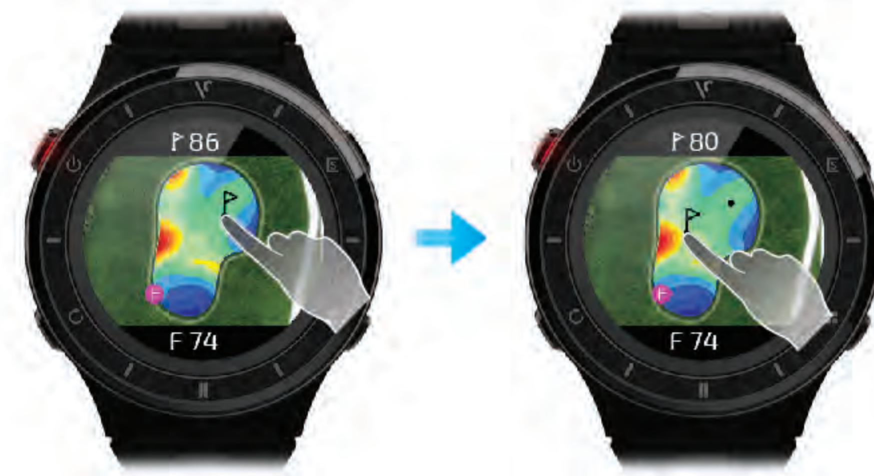
Tap the location to change

Tap the screen on the desired pin location to change the location