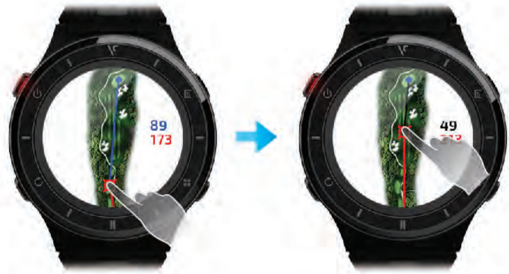
Tap target location

Check the remaining distance with tap from target location and pin