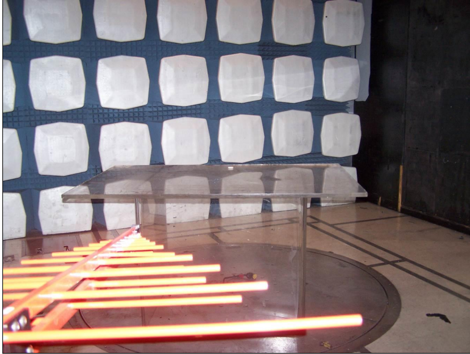
Photograph 2. Radiated Spurious Emissions, 30MHz-1GHz, Test Setup