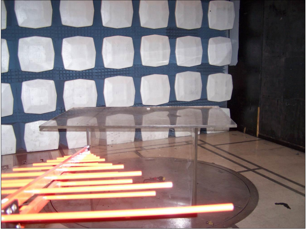
Photograph 1. Radiated Emissions, Test Setup