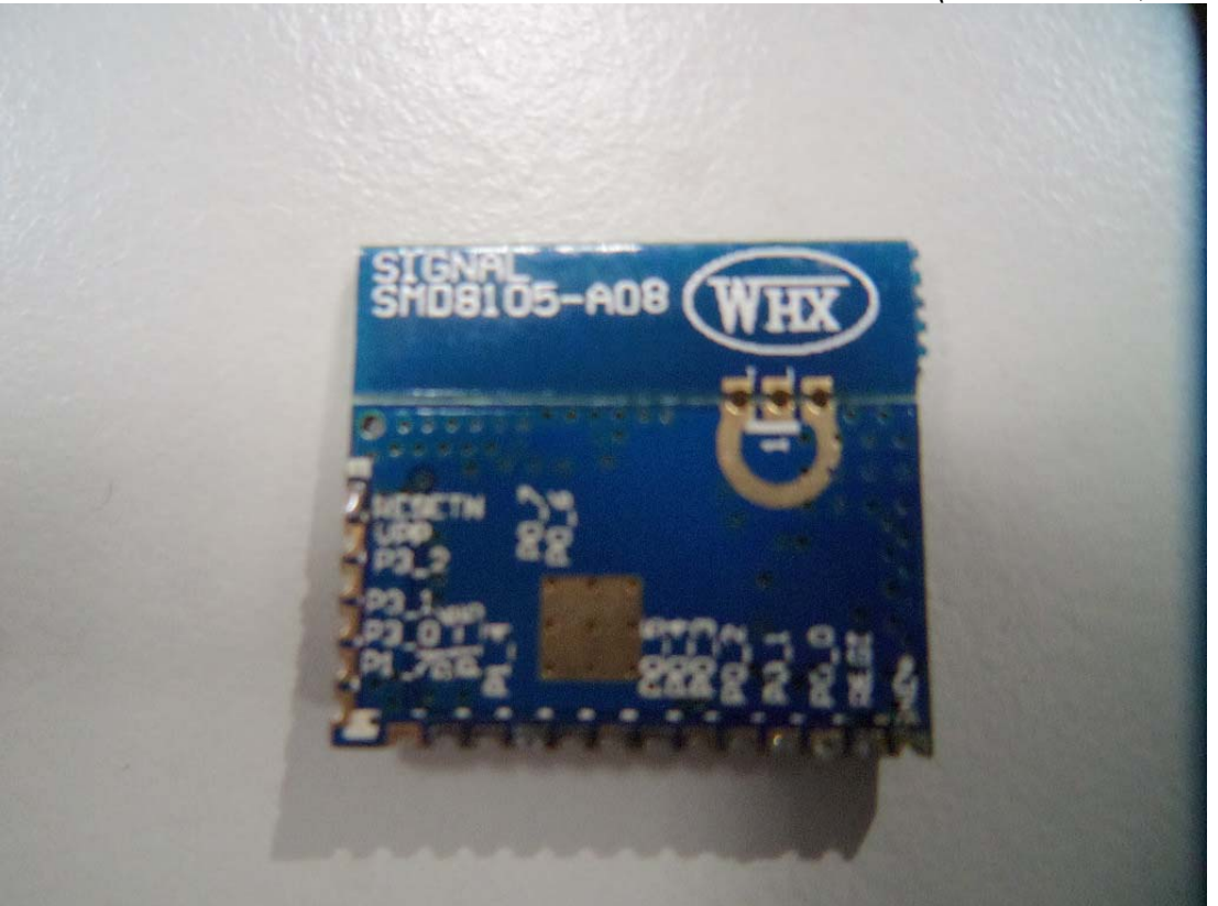
Figure 10 Internal View

Figure 9 Internal View (BLE Module, Back View)