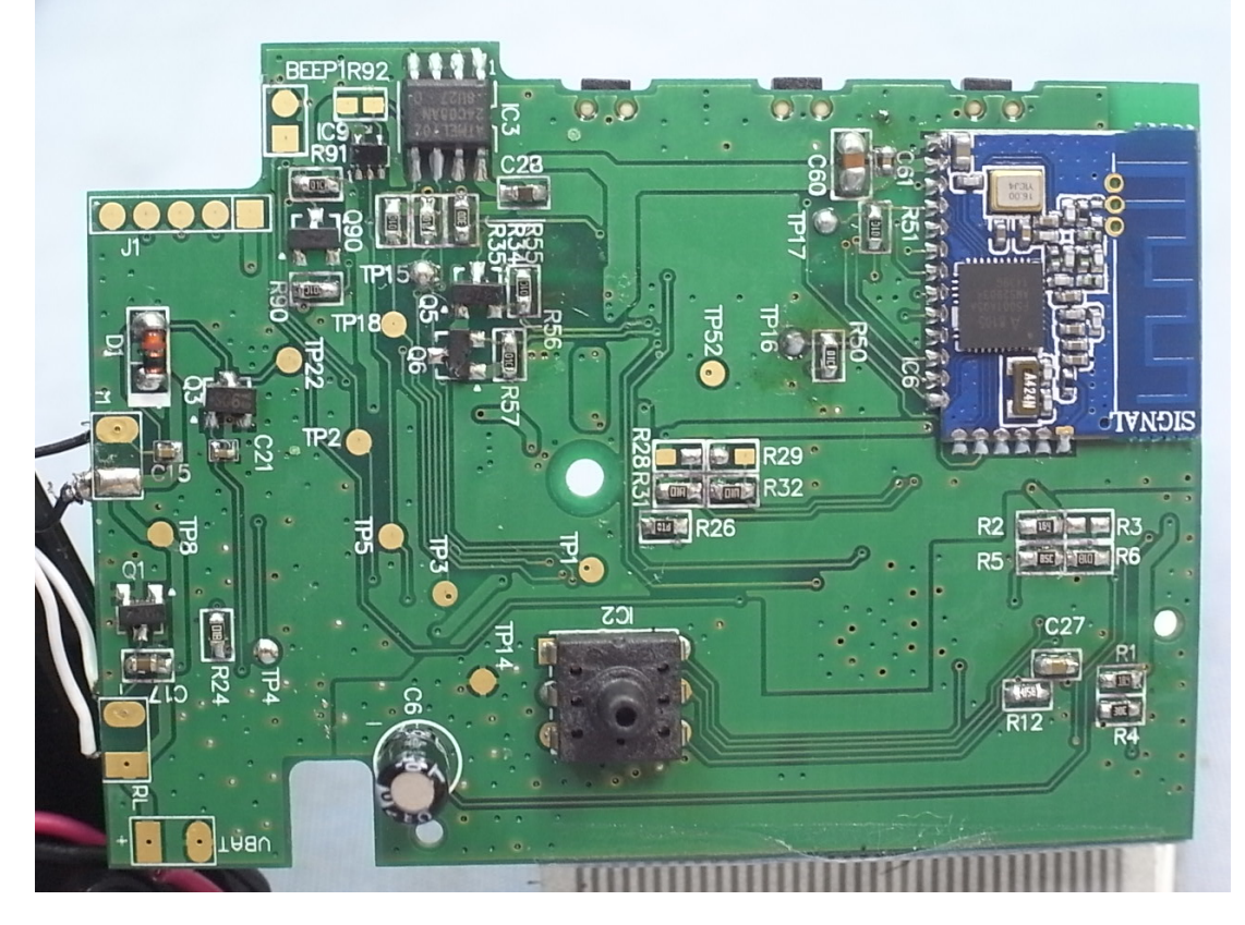
Figure 8 Internal View (BLE Module, Front View)