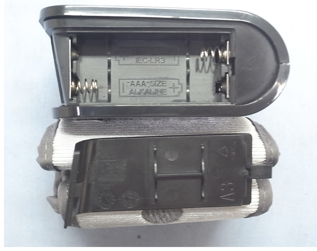
Figure 4 Internal View (Removed Cover, LCD Panel/Front View)

Figure 3 Internal View (Removed Battery Cover)