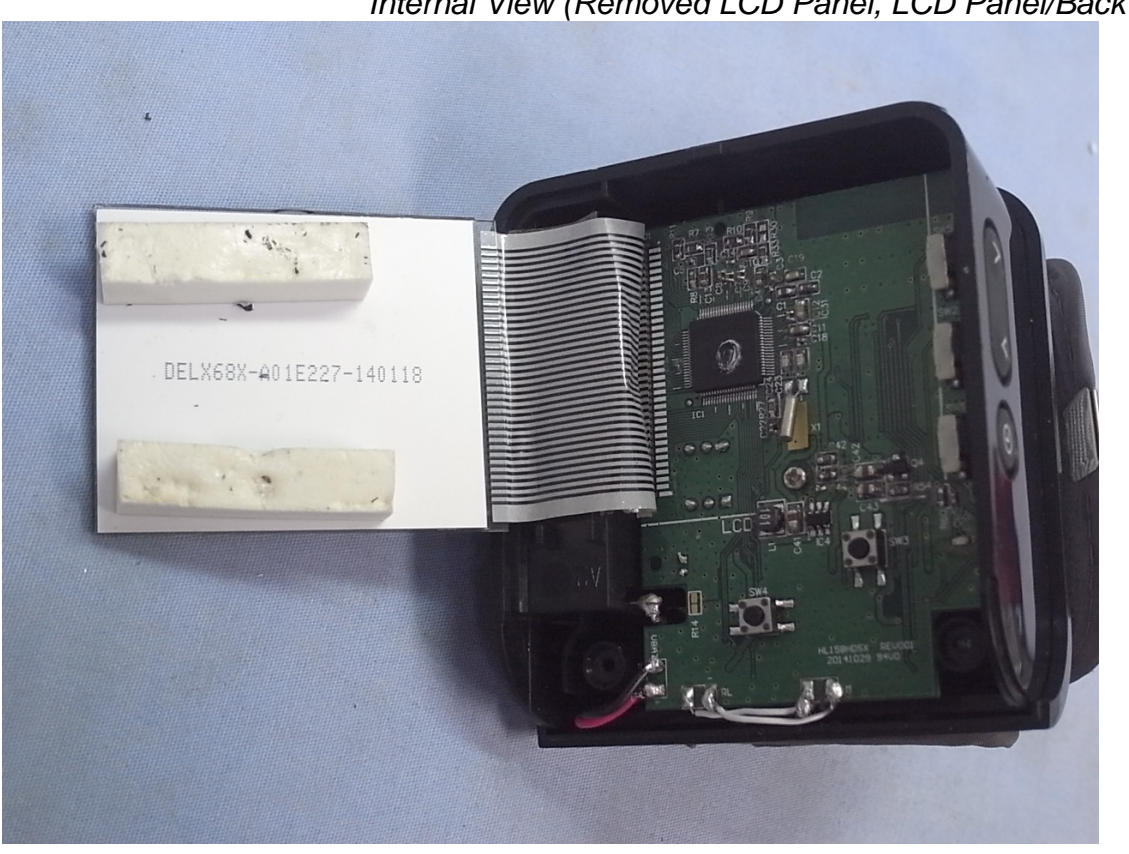
Figure 5 Internal View (Removed LCD Panel, LCD Panel/Back View)