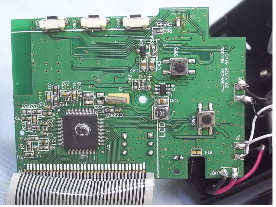
Figure 6 Internal View (Main Board, Front View)