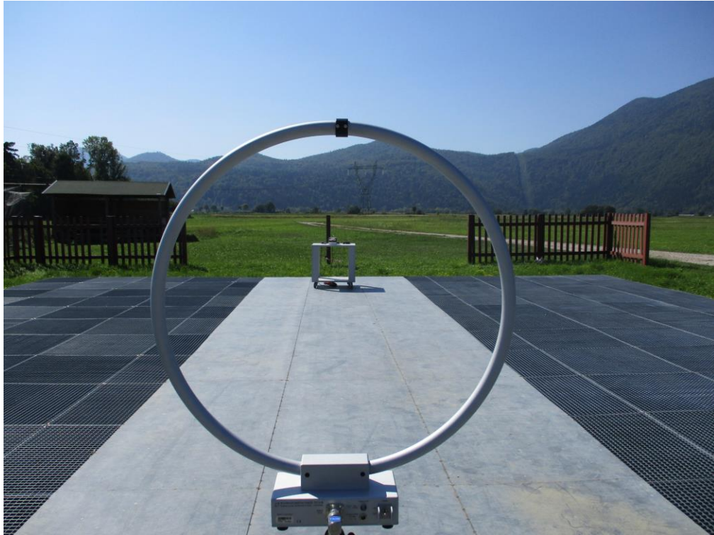
Figure 5: Radiated emission test from 9 kHz to 30 MHz on OATS