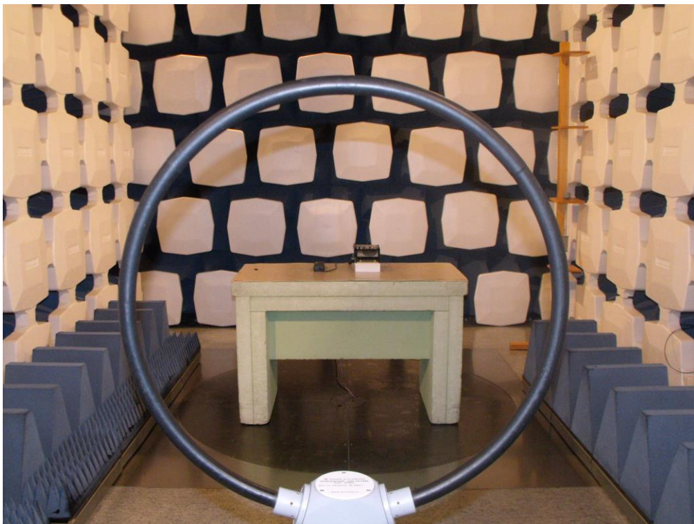
Figure 4: Radiated emission test from 9 kHz to 30 MHz in SAC