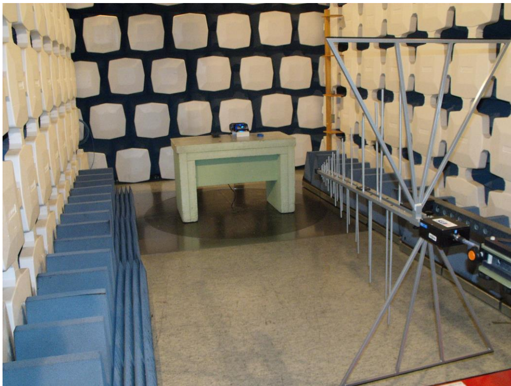
Figure 2: Radiated emission test from 30 MHz to 1 GHz in SAC