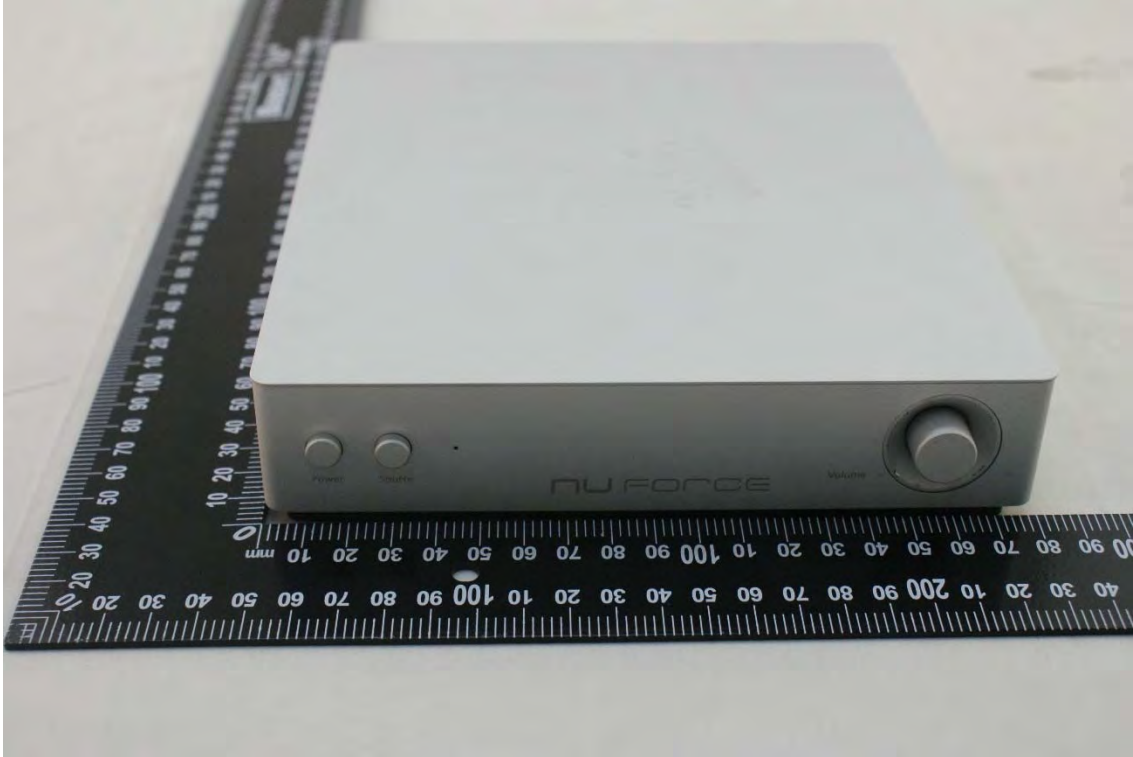
THE UP OF EUT