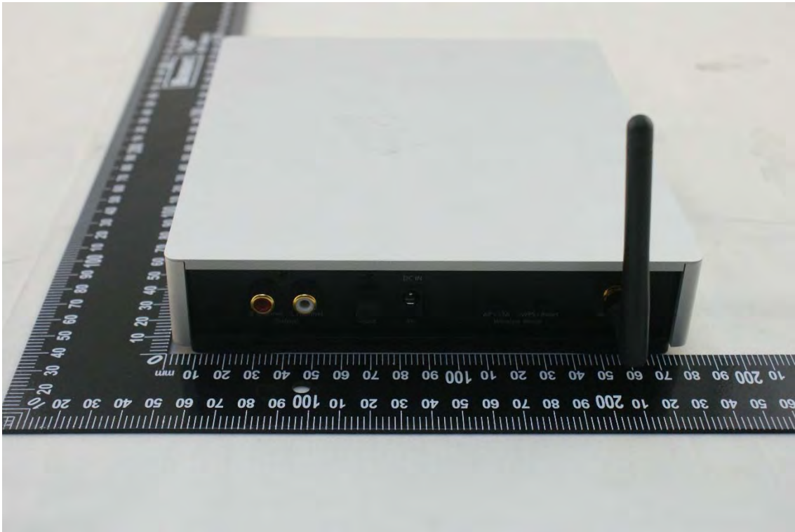
THE DOWN OF EUT