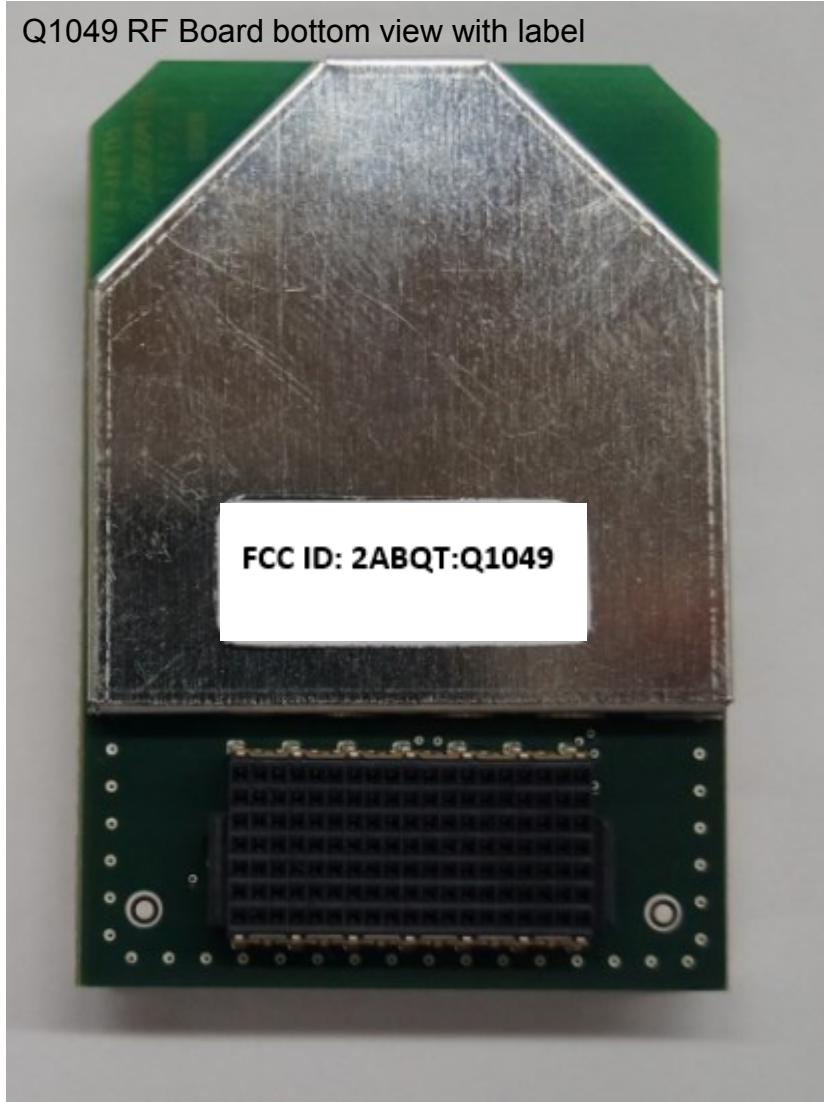
Q1049 RF Board bottom view with label