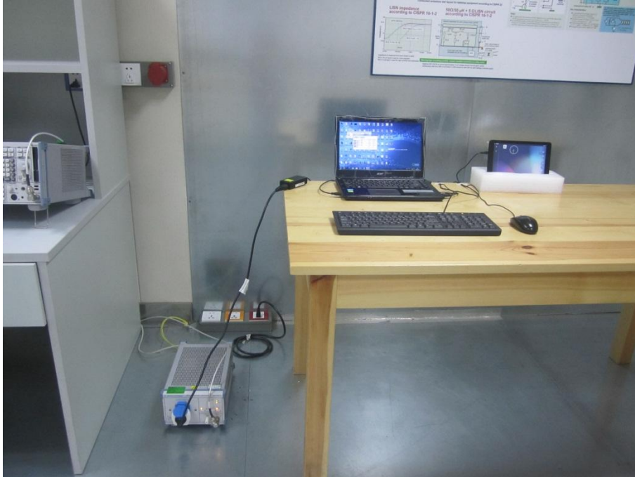
JBP radiation L