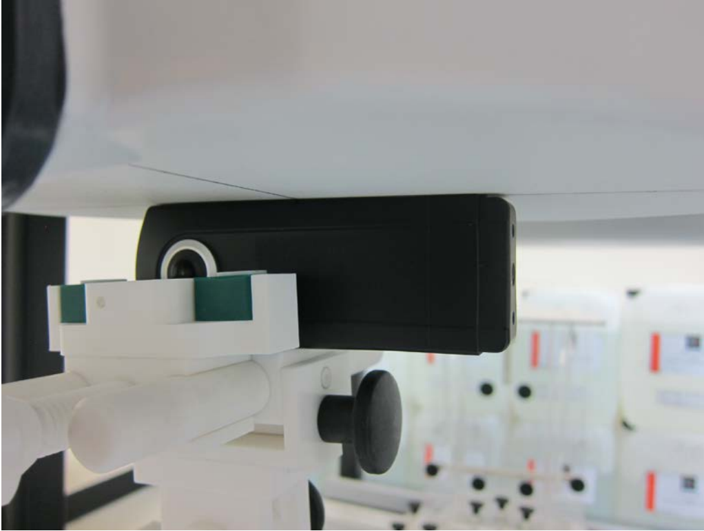
Figure 3 – Left surface with 0mm Separation