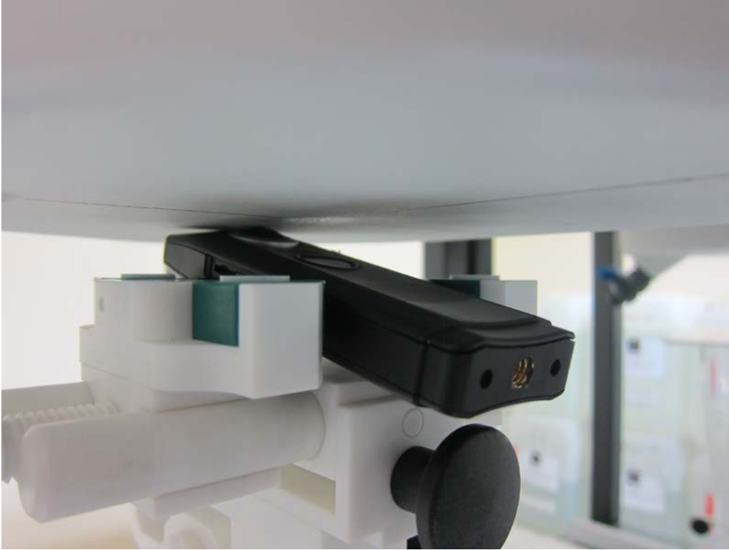
Figure 1 – Front surface with 0mm Separation