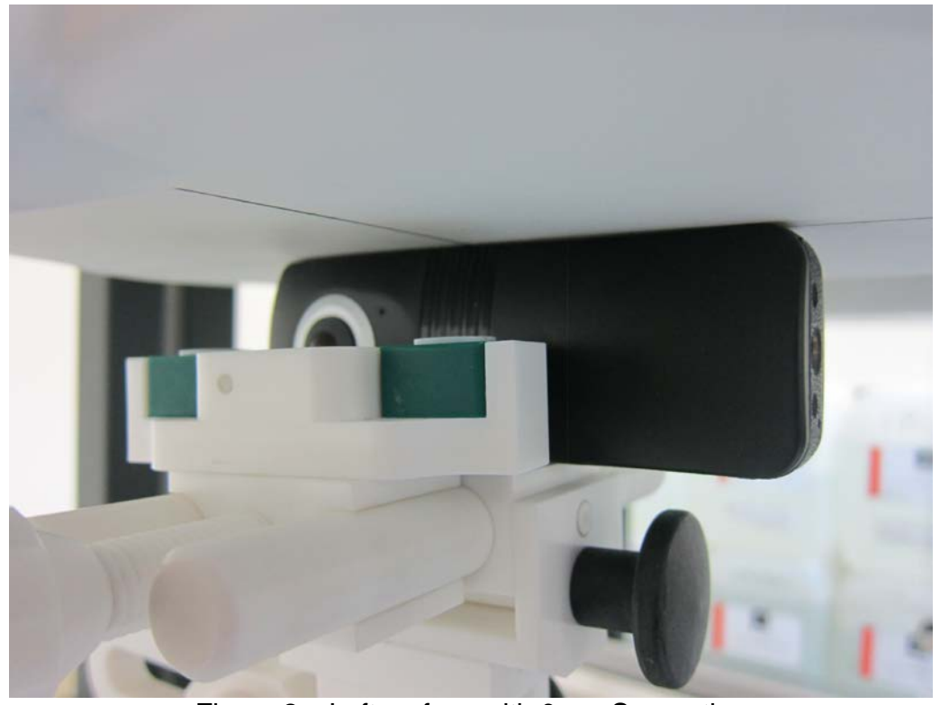
Figure 2 – Left surface with 0mm Separation