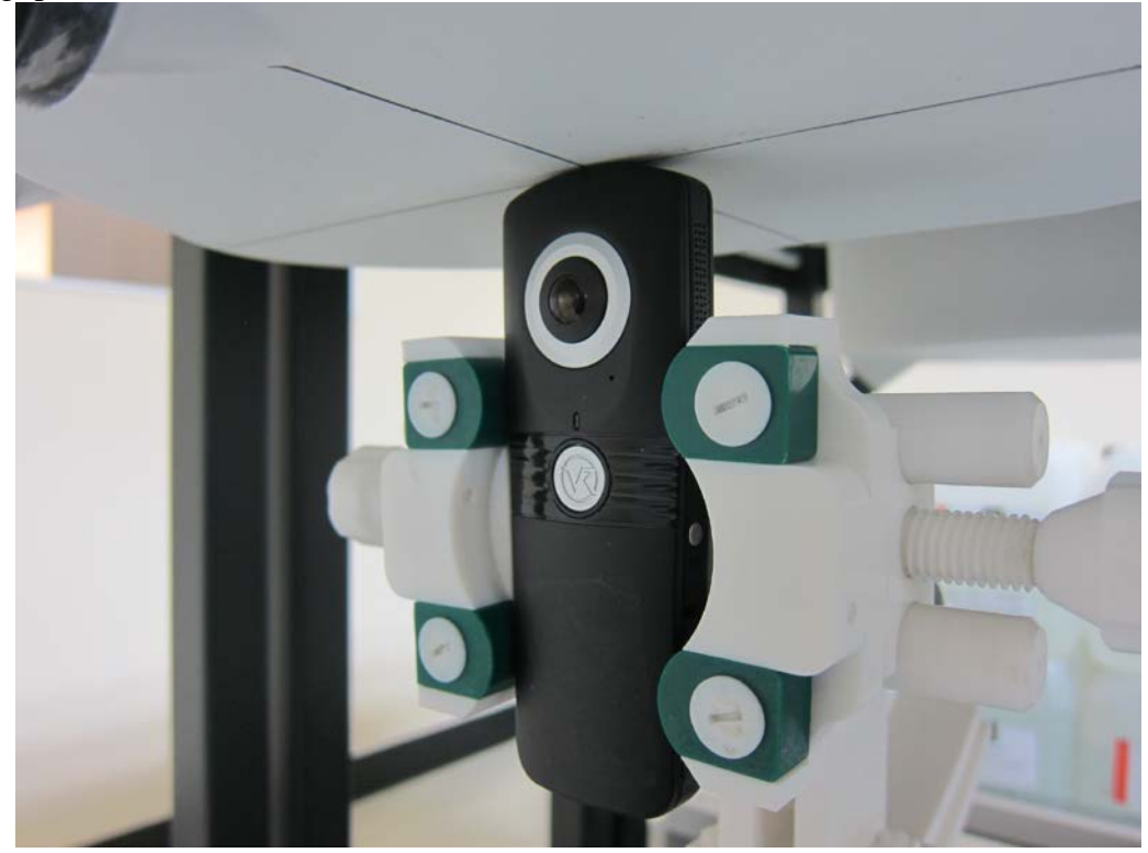
Figure 1 – Top surface with 0mm Separation