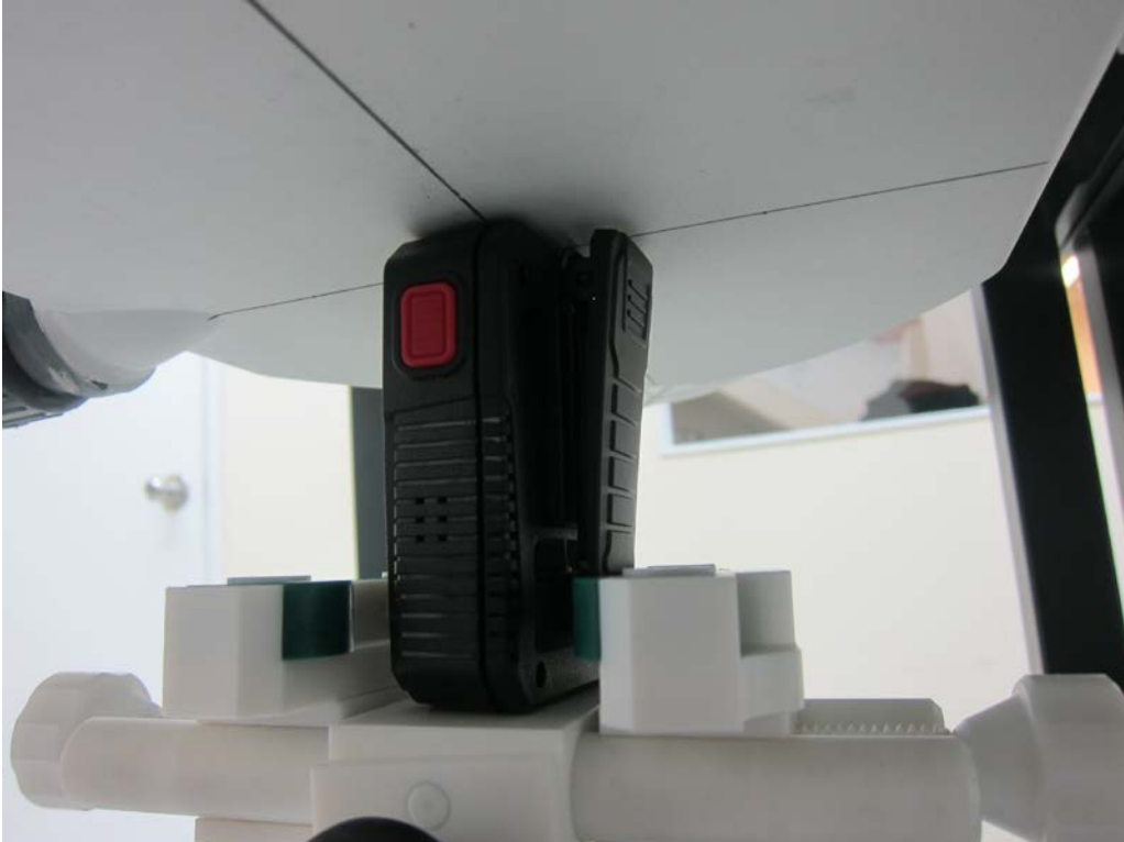
Figure 4 – Top surface with 0mm Separation ( with Belt-clip )