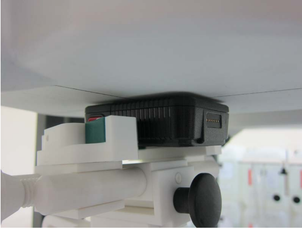
Figure 3 – Back surface with 0mm Separation