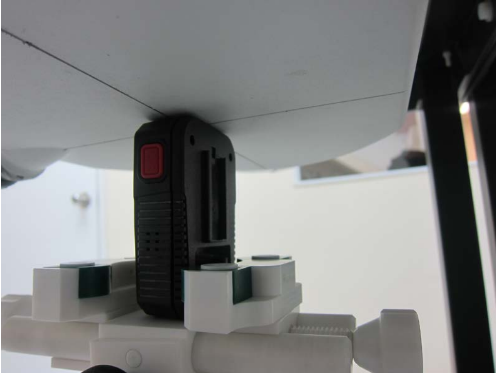
Figure 2 – Top surface with 0mm Separation