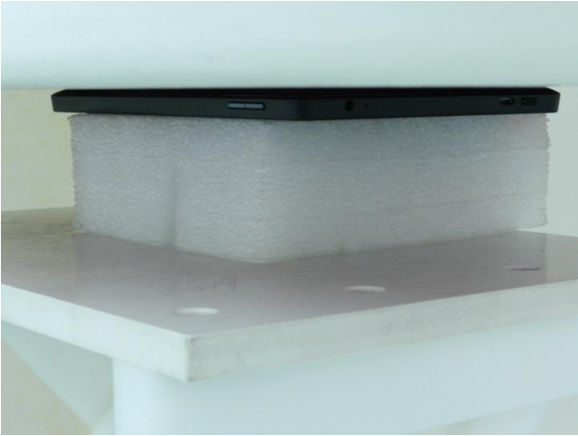
Bottom Face, Test Separation 0 cm