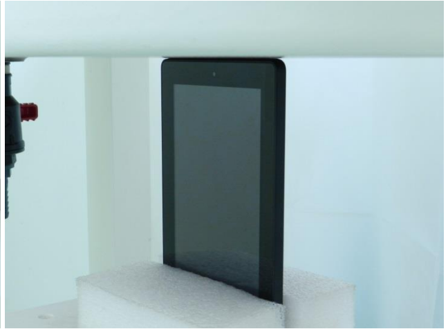
Edge1, Test Separation 0 cm