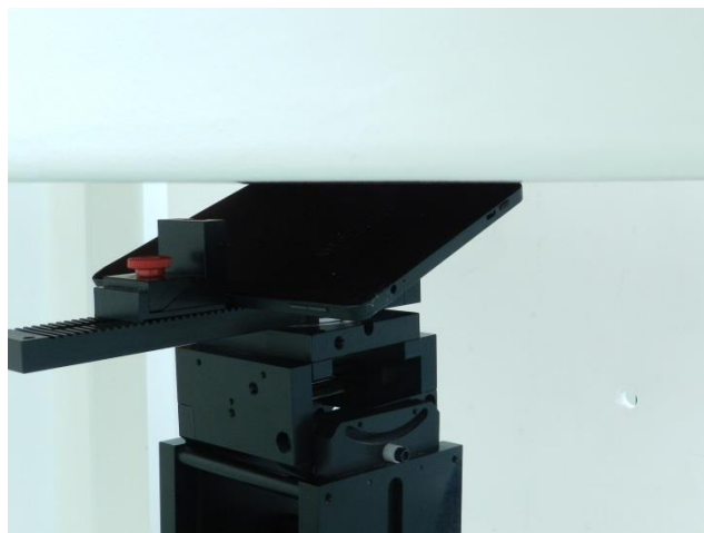
Bottom Slant of Edge2, Test Separation 0 cm