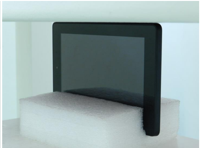
Edge2, Test Separation 0 cm