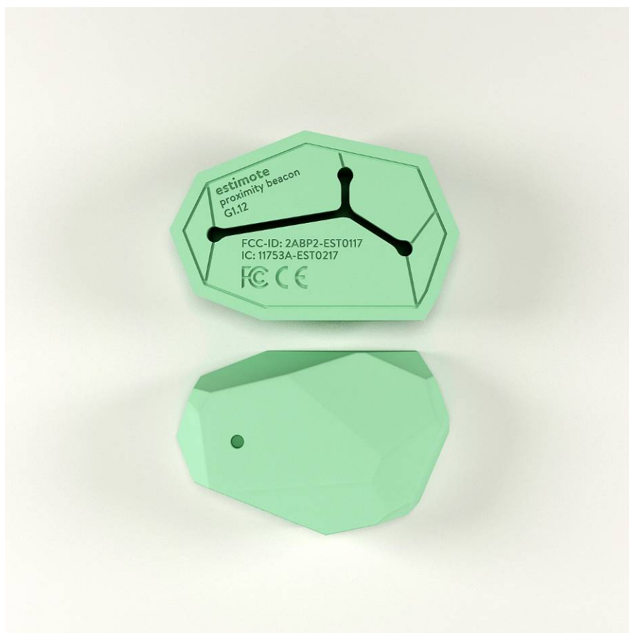
Figure 2. Label on Silicon Cover

FCC Part 15 Certification 2ABP2-EST0117 11753A-EST0217 17-0142 June 21, 2017 Estimote Beacon G1.12