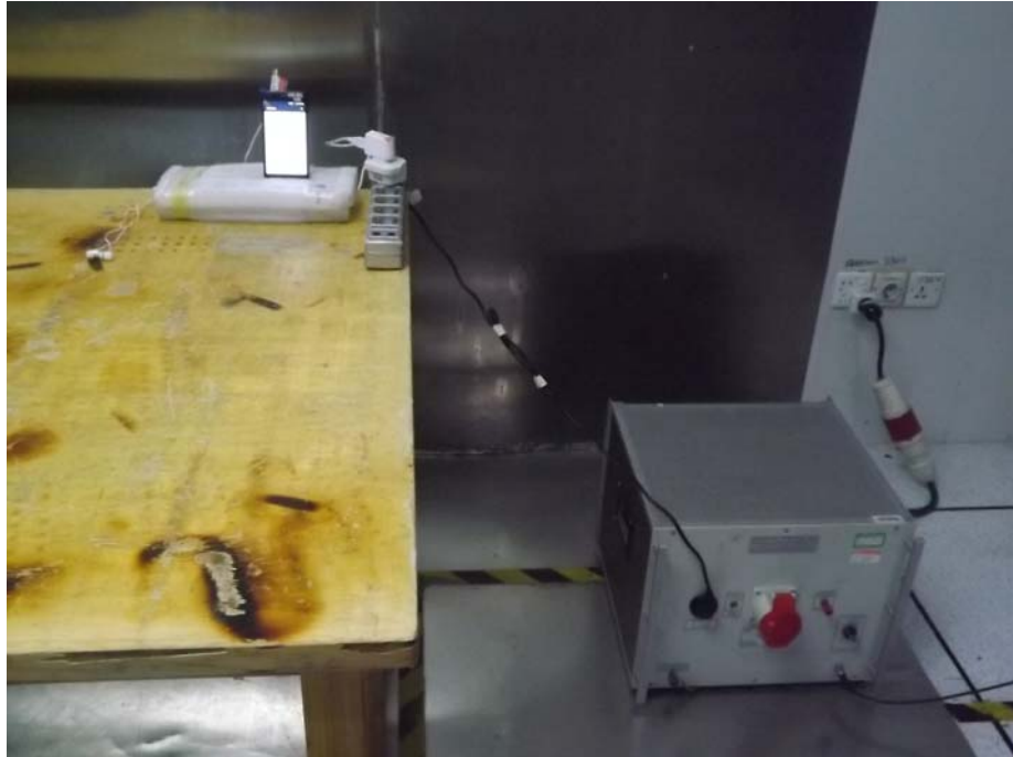
Test Site 1#