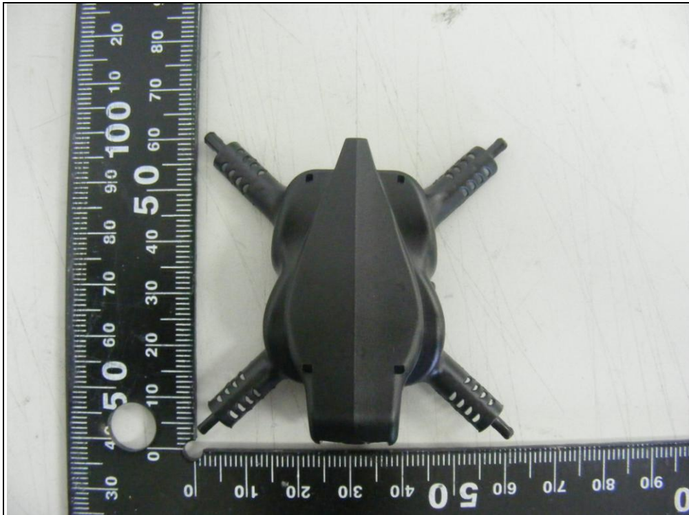
Bottom view of EUT