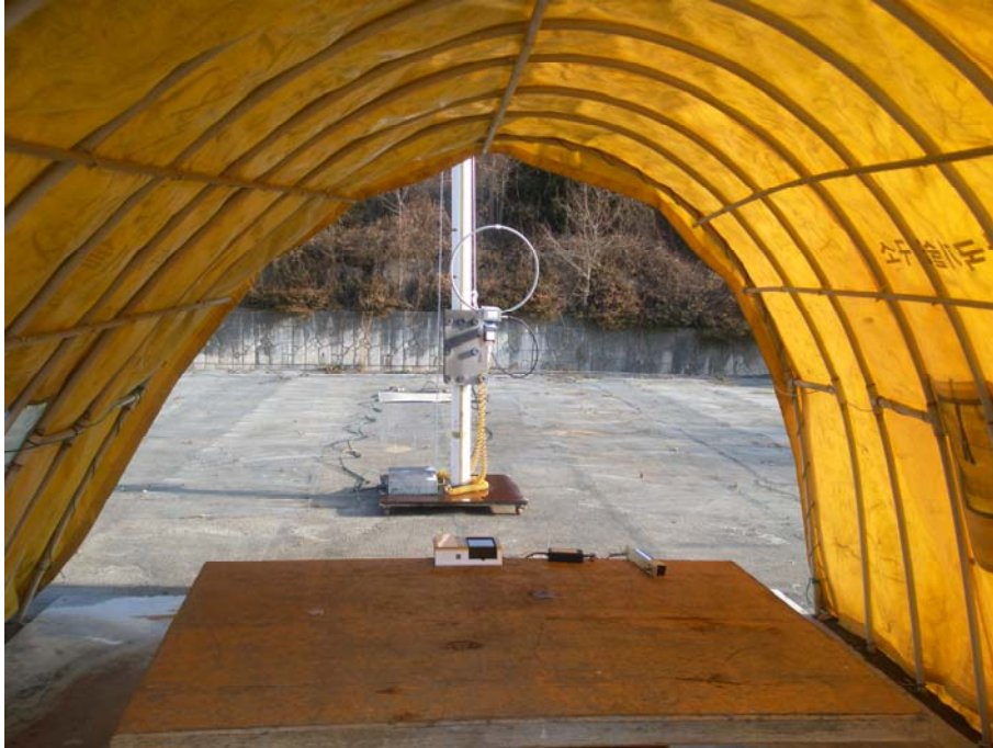
Photograph 1 : Setup for radiated Emissions (below 30 MHz)