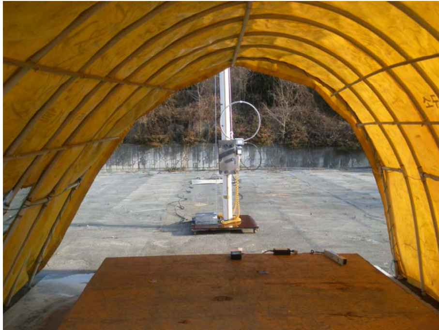
Photograph 1 : Setup for radiated Emissions (below 30 MHz)