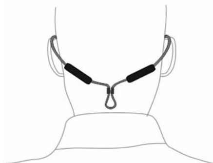
d. Reduce cable slack with sliding cable cinch for the most secure and comfortable fit.