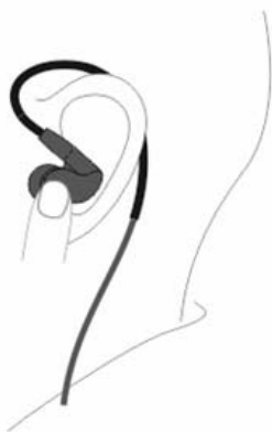
c. Bend the memory wire around the back of your ears.