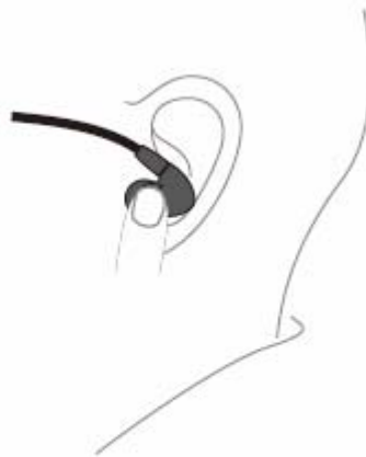
b. Straighten the memory wire and