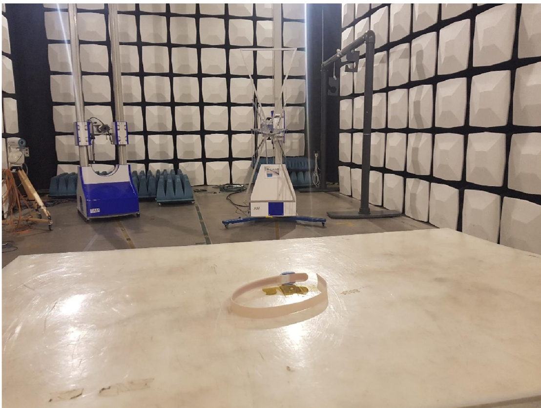
EUT in position Z