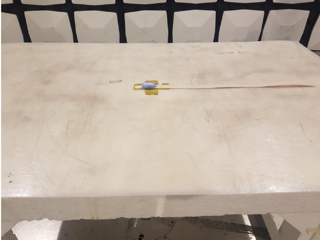
EUT in position Y