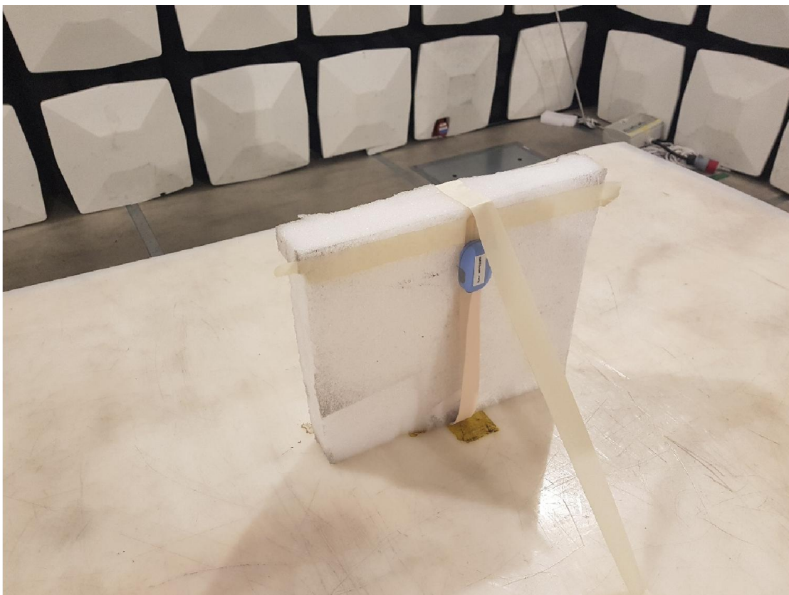
EUT in position X