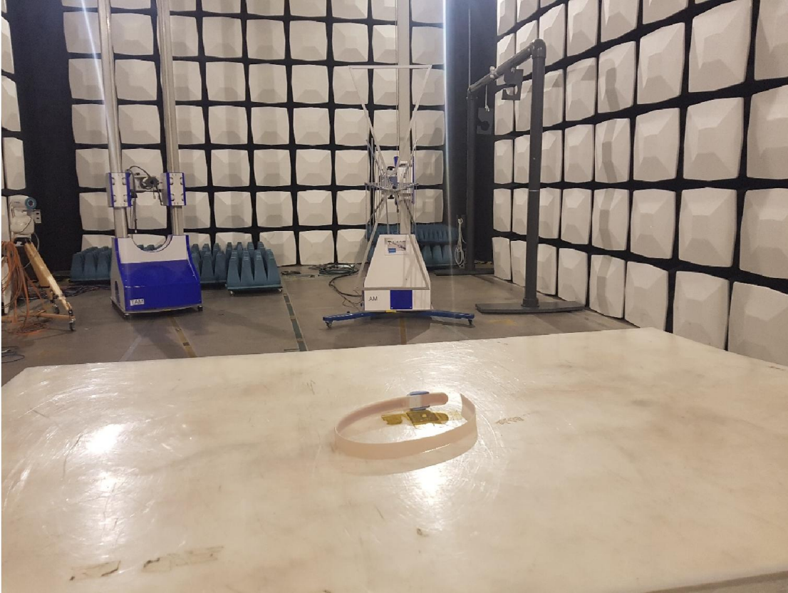
Test set up radiated emission 30 MHz – 1GHz