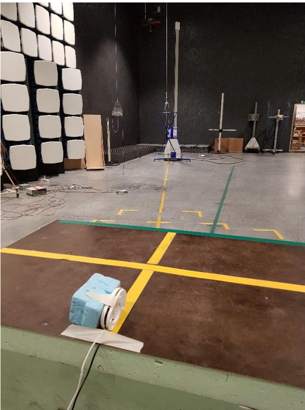
EUT in position Y