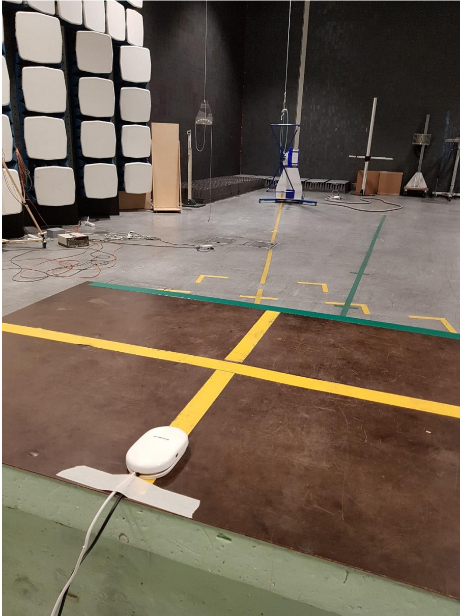
Test set up radiated emission 30 MHz – 1GHz