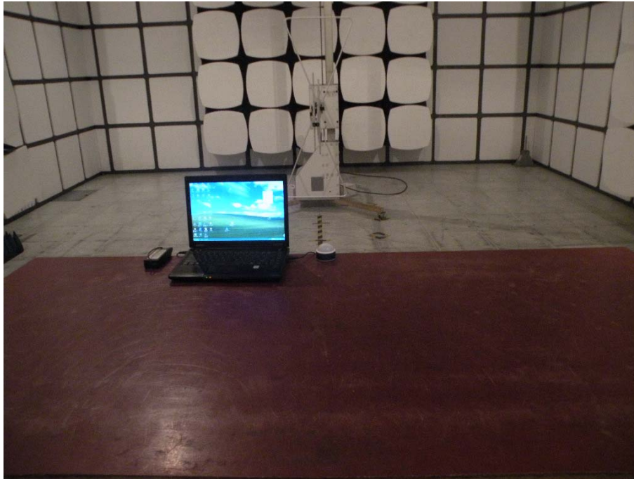
Photos of Radiated emission