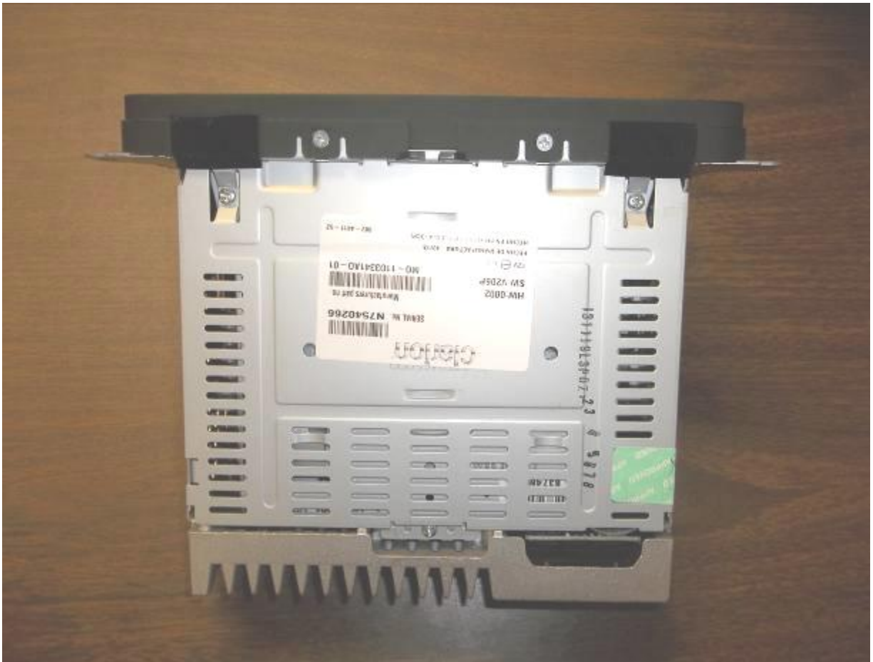
Figure 2. EUT Top View

FCC Part 15 14-0063 Electronica Clarion S.A. de C.V 2ABGYBTD33-CLARION April 14, 2014 BTD3341