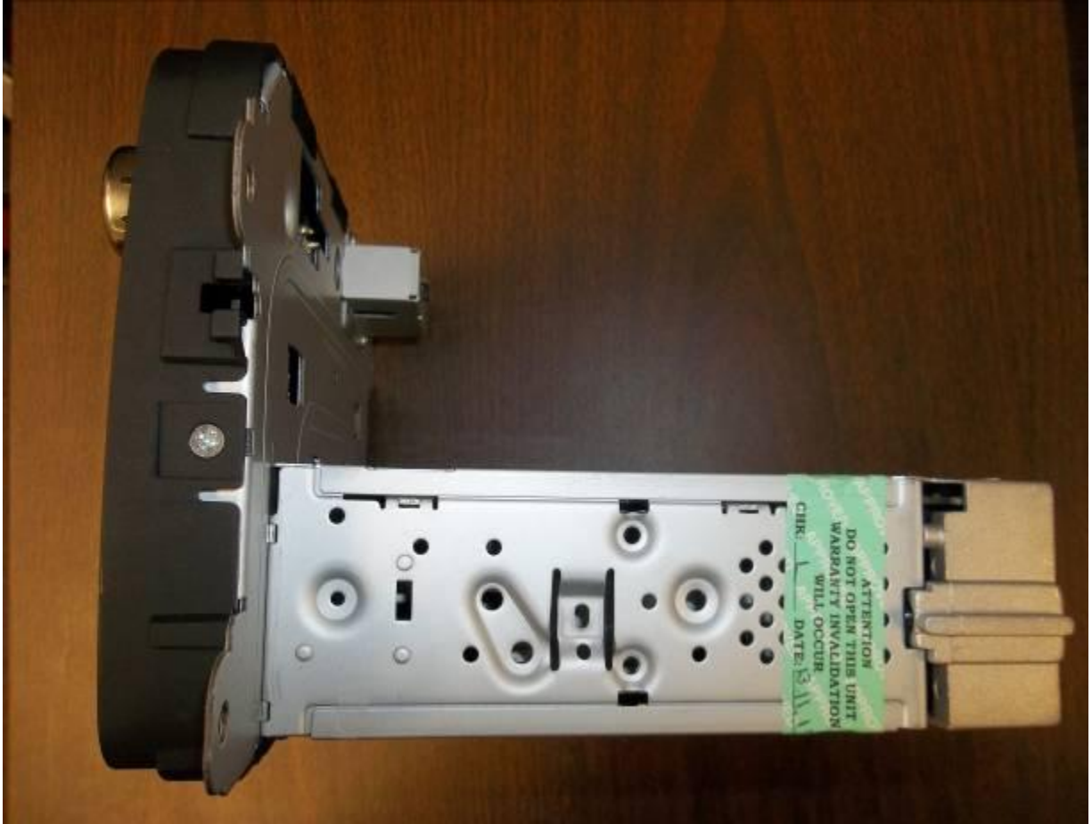
Figure 6. Left Side

FCC Part 15 14-0063 Electronica Clarion S.A. de C.V 2ABGYBTD33-CLARION April 14, 2014 BTD3341