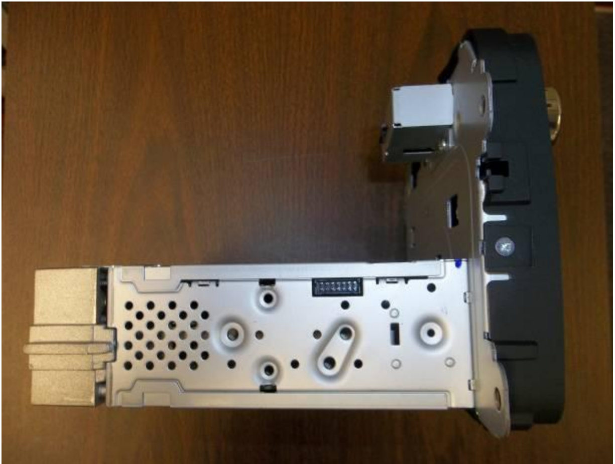
Figure 5. Right Side

FCC Part 15 14-0063 Electronica Clarion S.A. de C.V 2ABGYBTD33-CLARION April 14, 2014 BTD3341