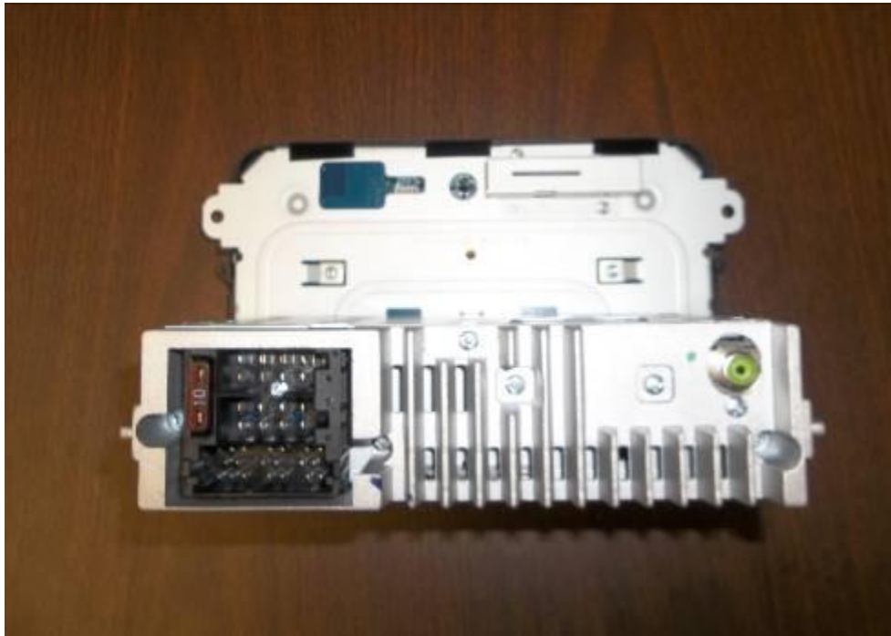
Figure 4. Back View

FCC Part 15 14-0063 Electronica Clarion S.A. de C.V 2ABGYBTD33-CLARION April 14, 2014 BTD3341