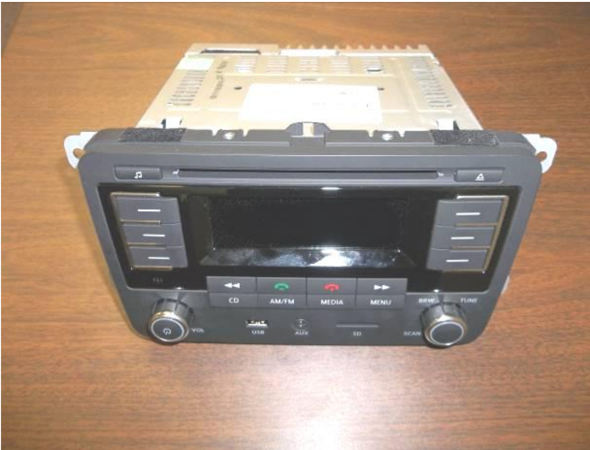
Figure 1. Front View