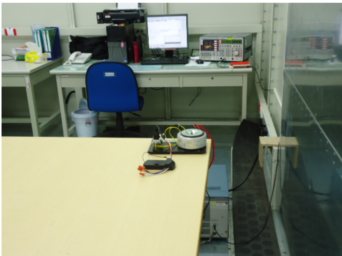
BACK VIEW OF CONDUCTED MEASUREMENT