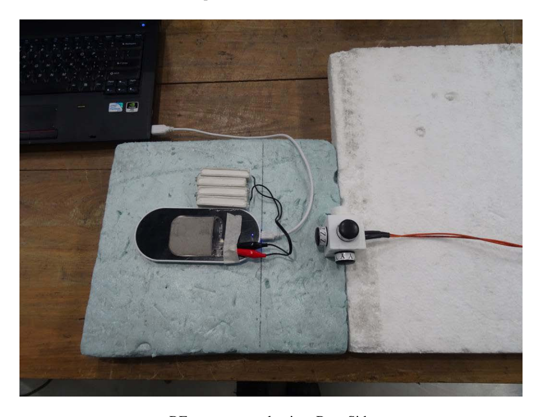
RF expousre evaluation: Rear Side