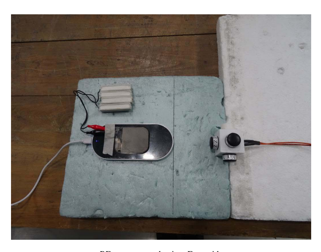
RF expousre evaluation: Front side

Report No.: 13070485-FCC-R1 Issue Date: Jan 17, 2014 Page: 24 of 30