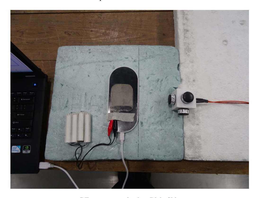
RF expousre evaluation: Right Side