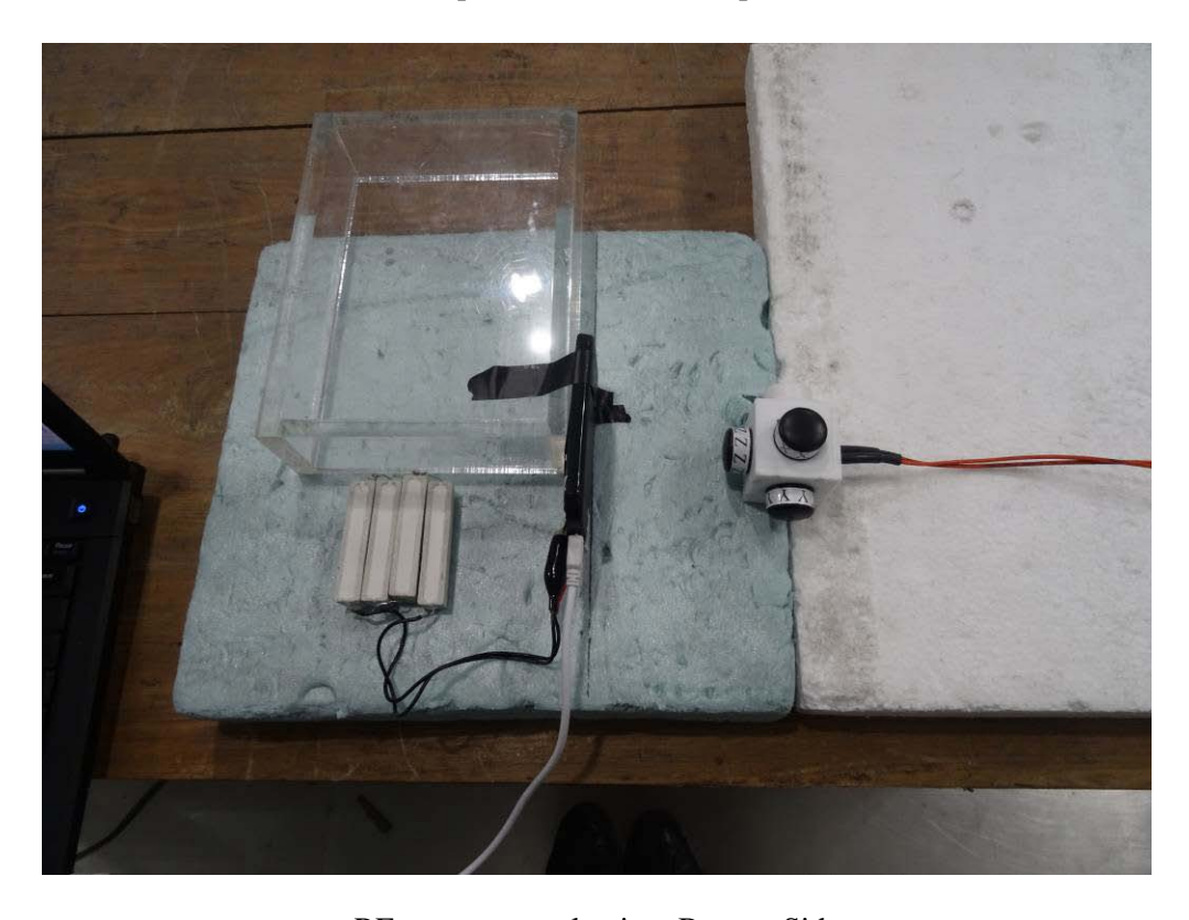
RF expousre evaluation: Bottom Side