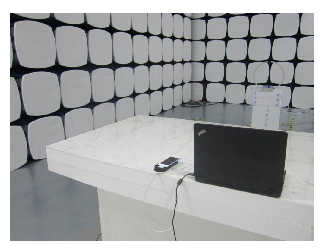
Radiated Spurious Emissions Test Setup Below 30 MHz - Front View

Report No.: 13070485-FCC-E1-18 Issue Date: November 26, 2013 Page: 32 of 38