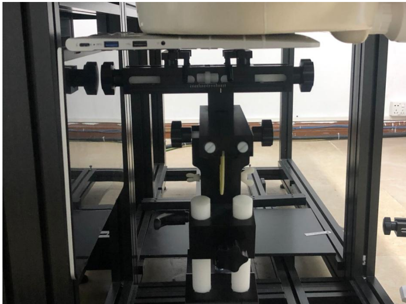
Bottom Surface (Test distance: 0mm)