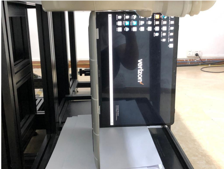
Left Side (Test distance: 0mm)