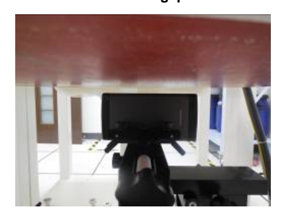
Left-side with gap 10mm