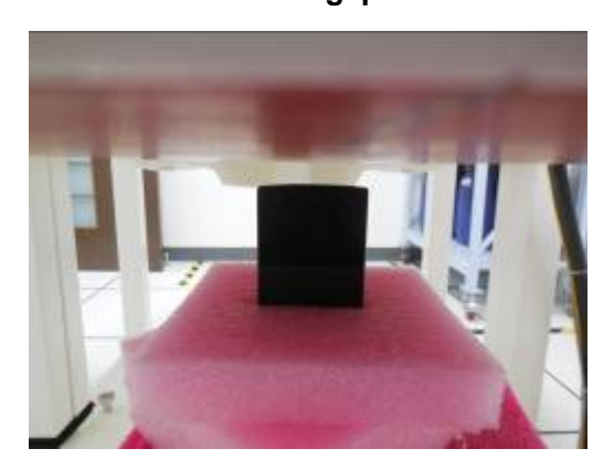
WIFI Test Setup Body Back with gap 10mm Front with gap 10mm