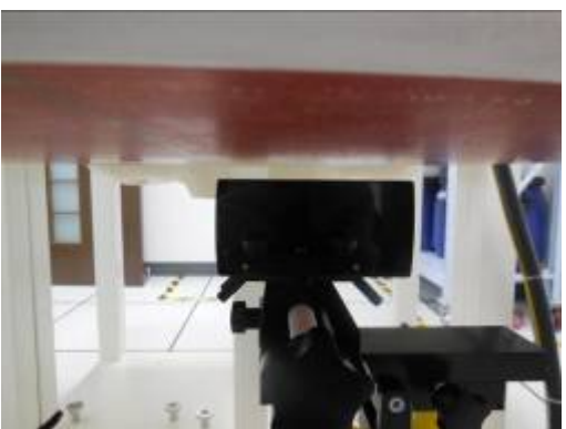
Bottom with gap 10mm