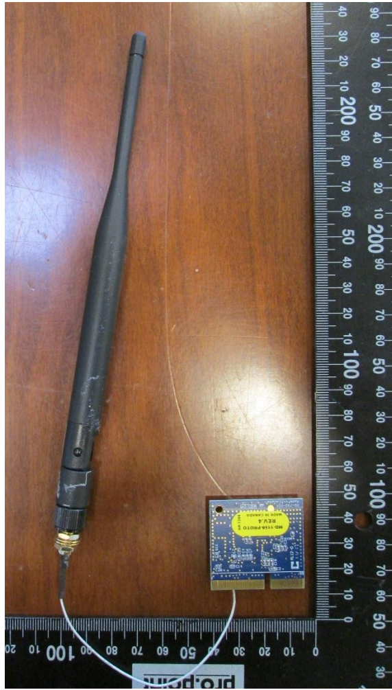
EUT – External view 2