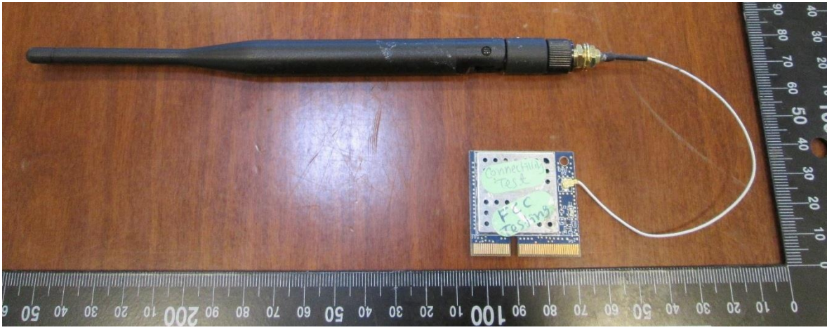
EUT – External view 1