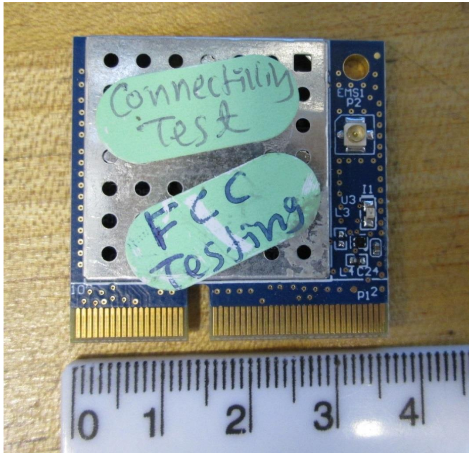
EUT – External, Close-up, view 1