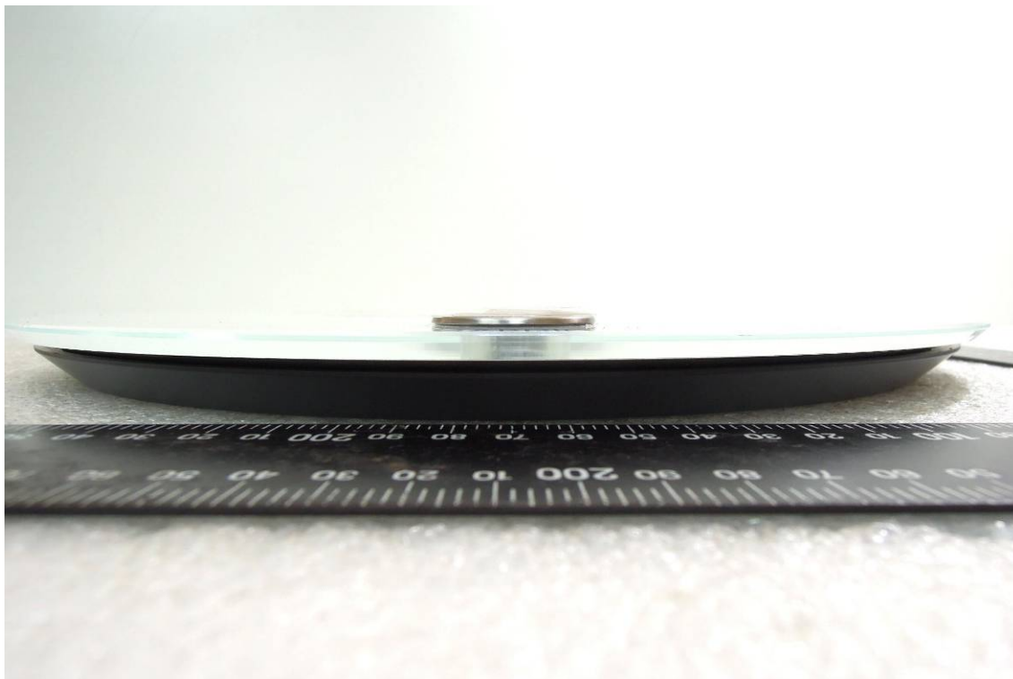
Side View of EUT – 2