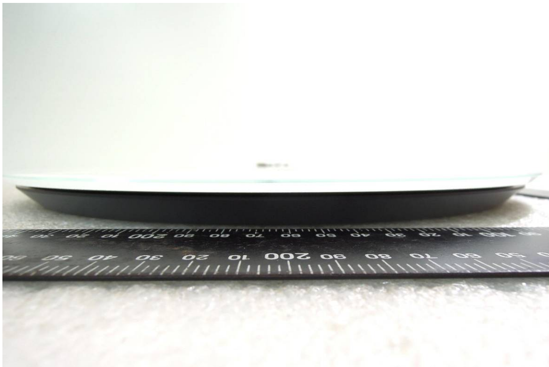
Side View of EUT – 4