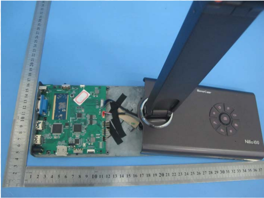
Photo 11 Internal of EUT