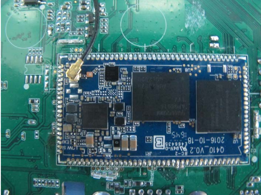
Photo 15 Appearance of PCB