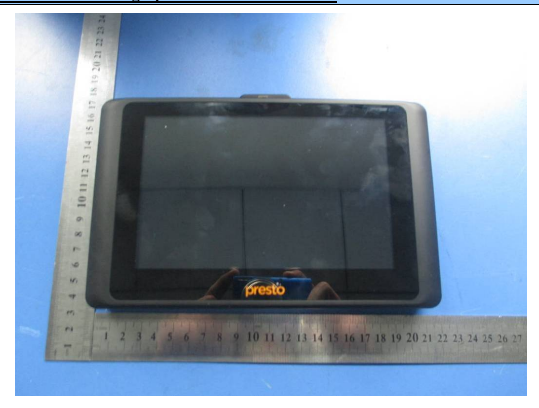
EUT - Front View