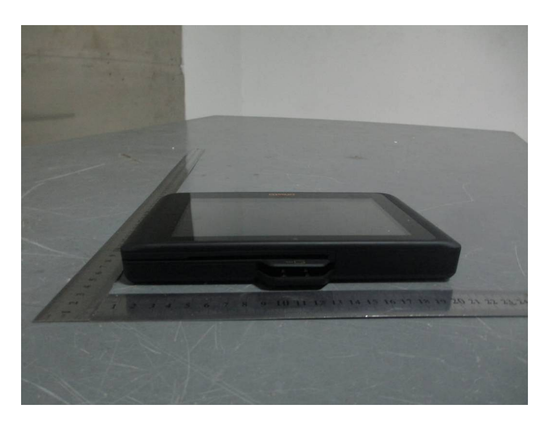
EUT - Top View

Report No.: 13070507-FCC-E Issue Date: November 28, 2013 Page: 20 of 34 www.siemic.com.cn