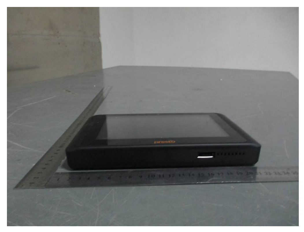
EUT - Bottom View