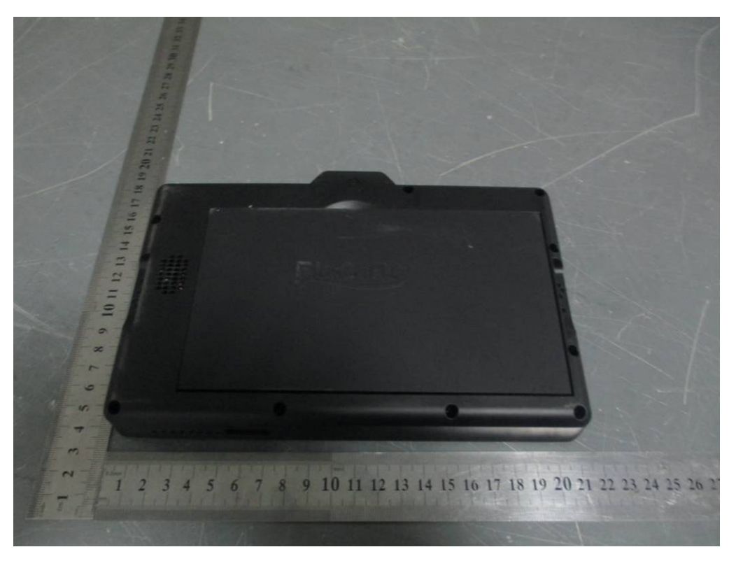
EUT - Rear View