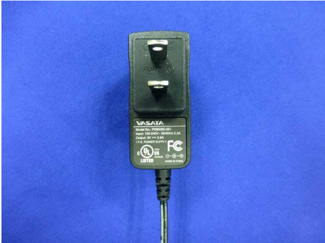
Figure 11 Power Adapter