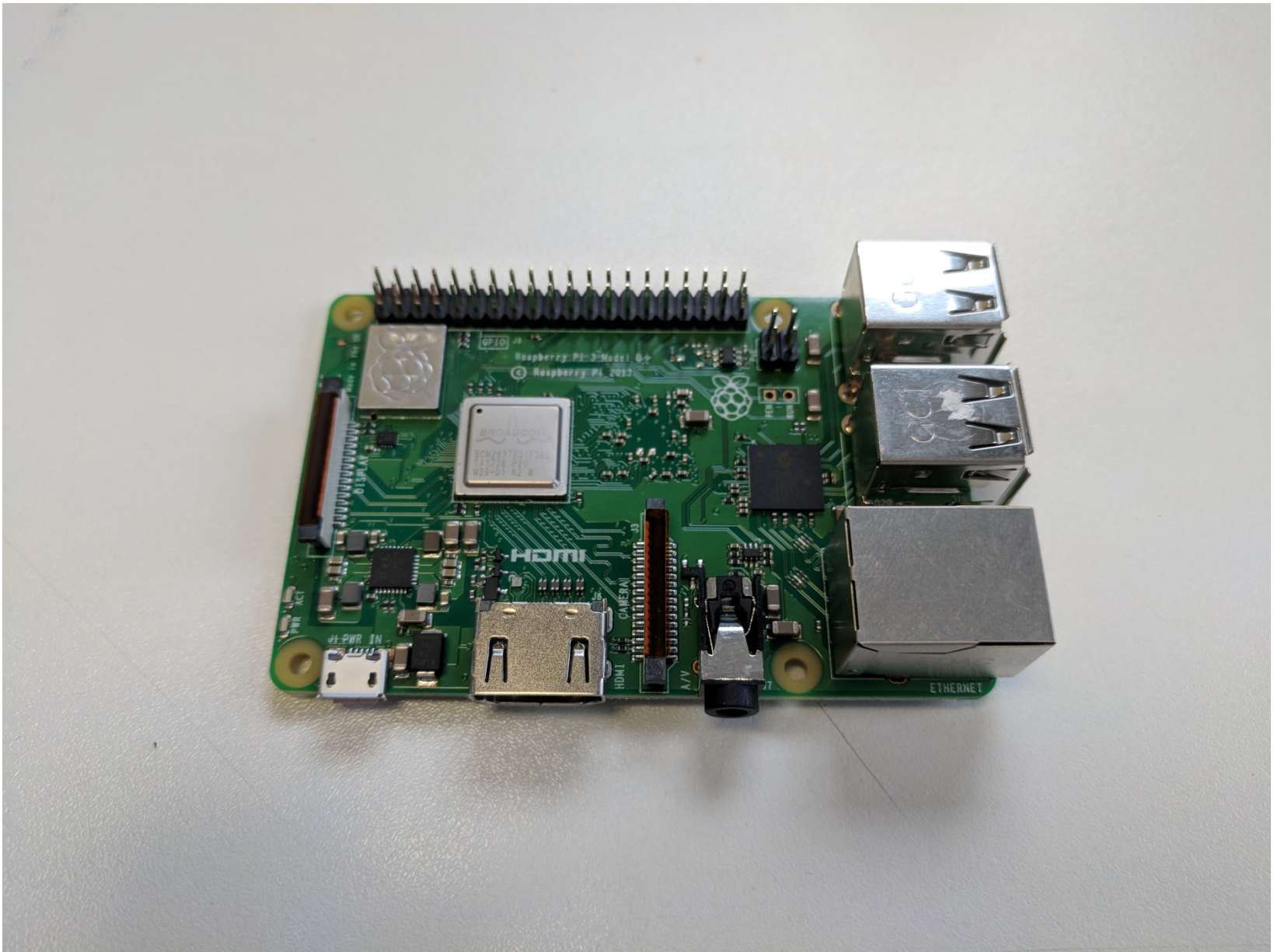
Front of PCB