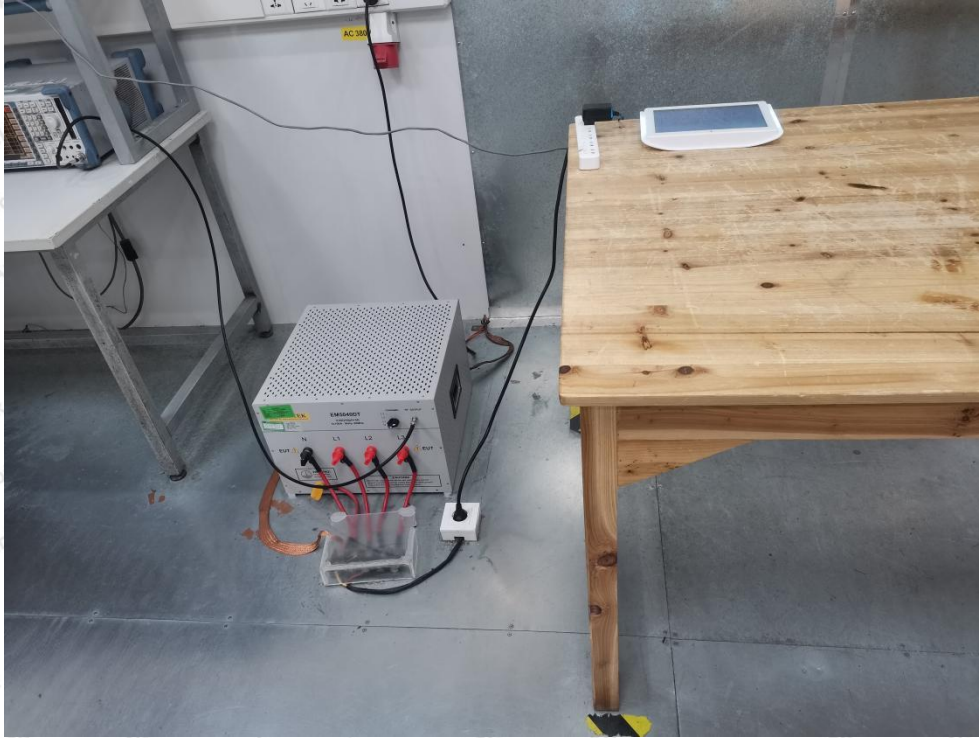
Photo of Radiation Emission Test