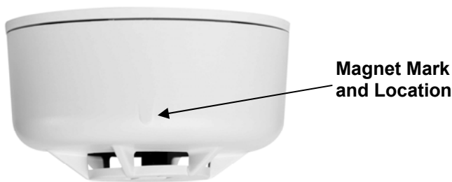
Figure 4: Magnet Mark

Note: Notify central station before any live testing to avoid fire response. The magnet test allows the sensor to send an actual alarm signal to the control panel, if a magnet is held against the housing for 15 seconds.